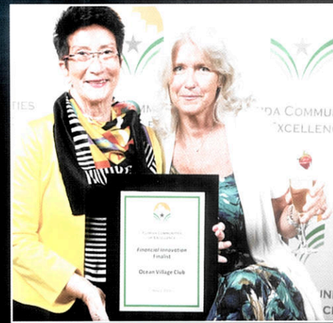
Ocean Village Club, 2014 Condo Community of the Year, celebrates on the red carpet