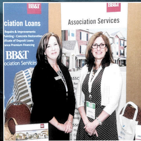
BB&T Association Services' team of financial experts