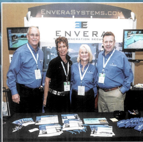
Envera Systems exhibits "Next Generation Security" solutions

One in four Florida residents lives in a community managed by an association. This fact combined with the uncertainties and challenges facing neighborhoods and cities everywhere makes strengthening community associations more important than ever.