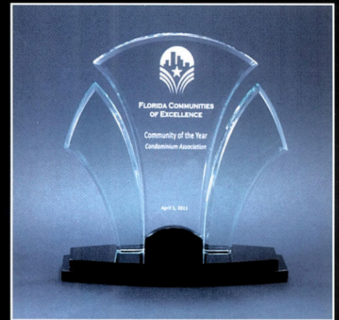
Hundreds of communities have been honored since 2009