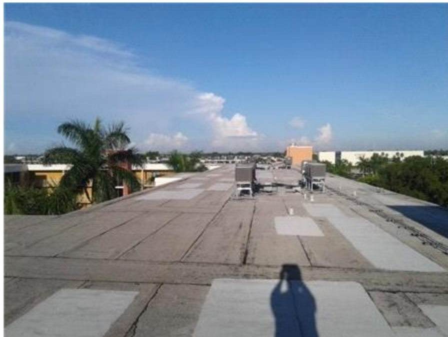
Roof Overview General roof overview