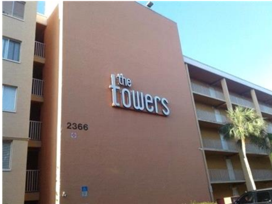
The Towers Building Identification