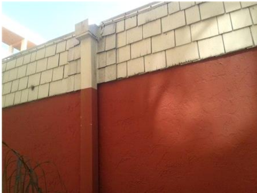
009G- TPO Roof - Downspouts

Roof edge appears to be in good condition.