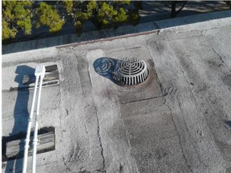
F-247R- The Towers - BUR - Loose Granules

Removed the loose granules from the roof surface, and disposed of properly.