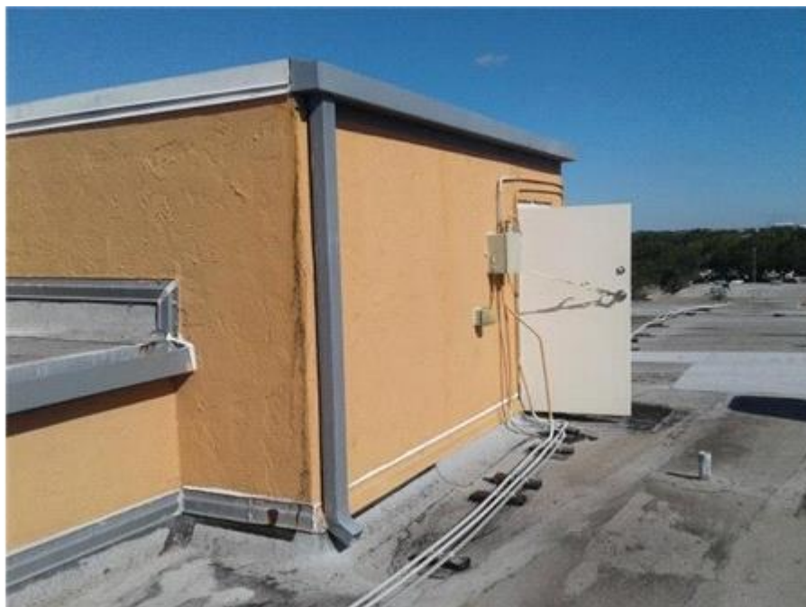
009G- The Towers - BUR - Downspouts

The downspouts appear to be in good condition.