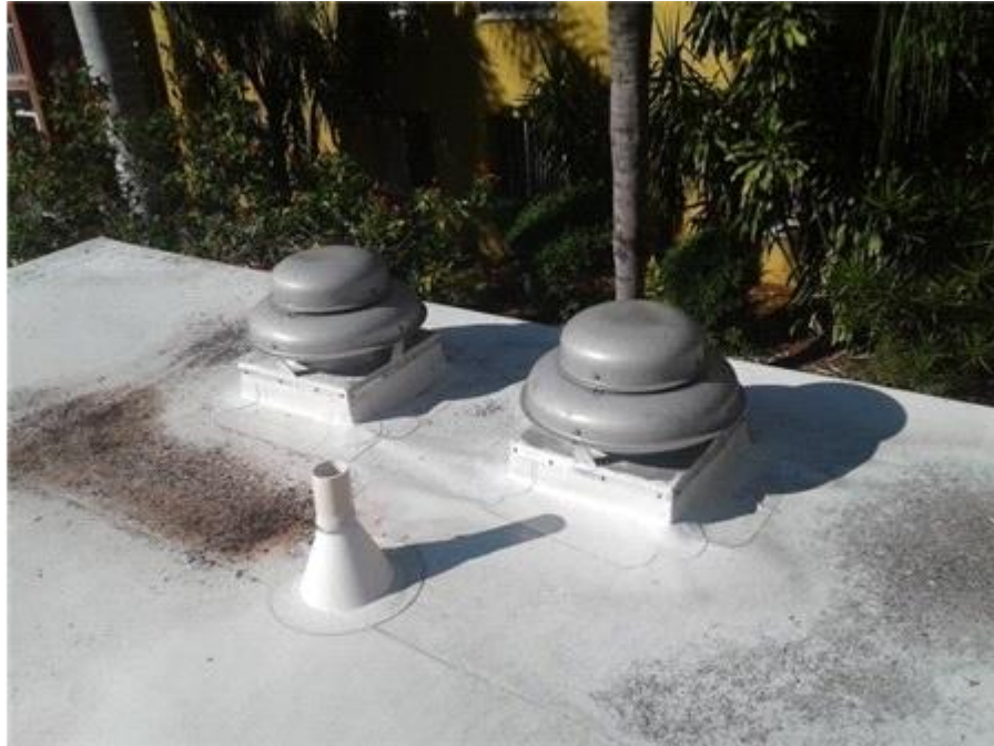
002G- TPO Roof - Roof Vents

Roof vents appear to be in good condition at this time.