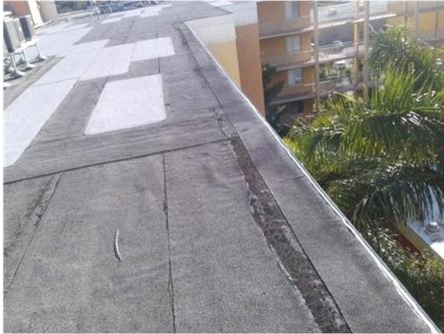
016F- The Towers - BUR - Roof Edge

Roof edge appears to be in fair condition.