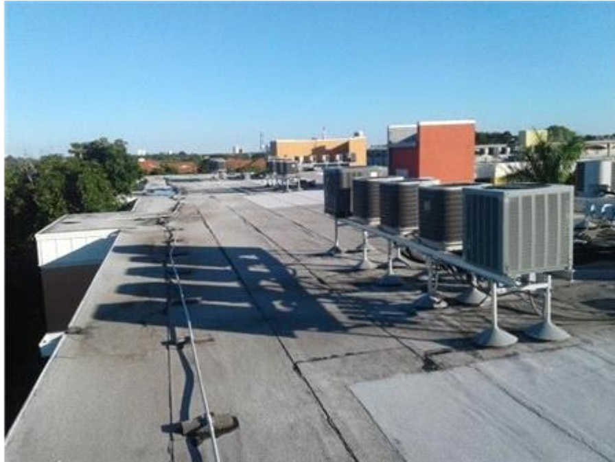
029- The Towers - BUR - Roof Overview