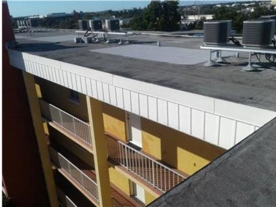
The Towers - BUR - Edge Metal/Fascia

Edge metal/fascia appears to be in good condition at this time.