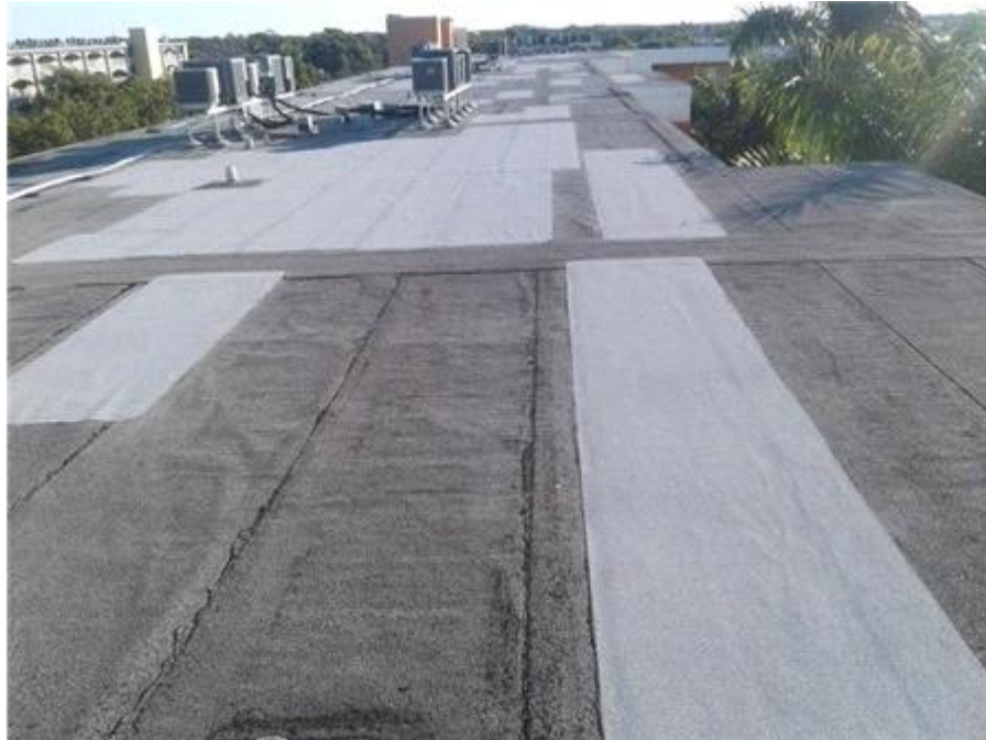
001F - The Towers - BUR - Surface Overview

The roof surface appears to be in fair condition at this time.