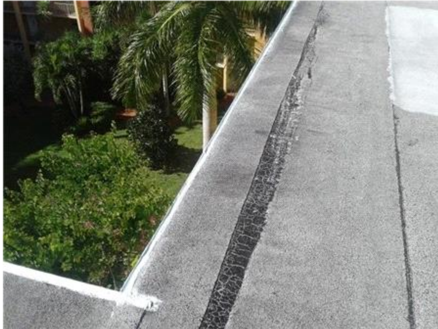
015- The Towers - BUR - Sealant Repair

Removed existing sealant and replaced with M1 sealant.