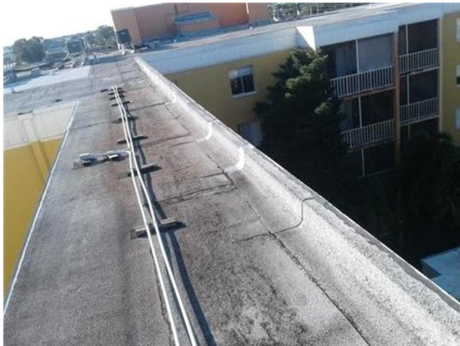
004F - The Towers - BUR - Base Flashings

Roof edge appears to be in fair condition.