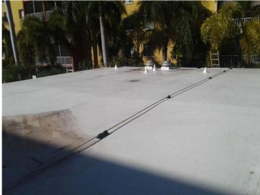
029- TPO Roof - Roof Overview