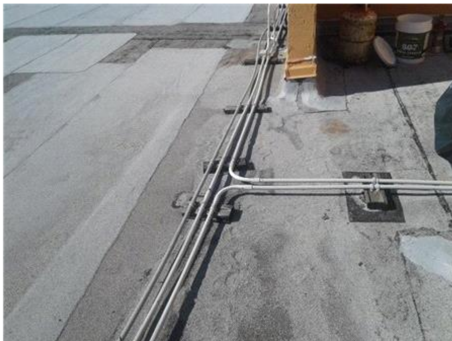
F-247- The Towers - BUR - Loose Granules

Identified loose granules on the roof surface.