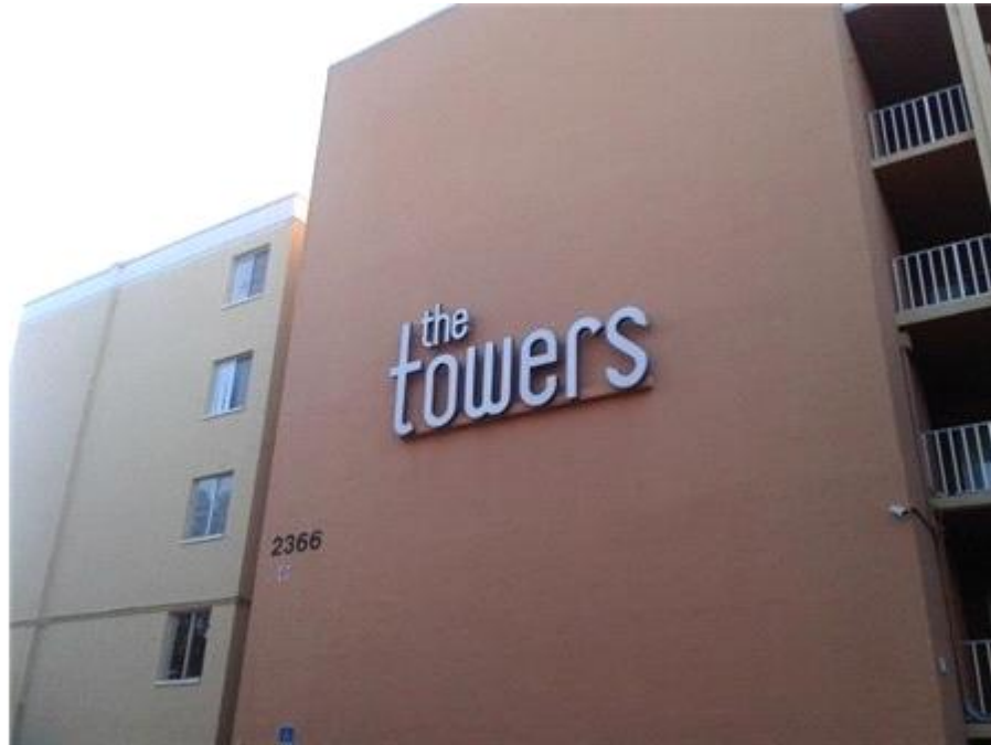
The Towers - BUR Building Identification