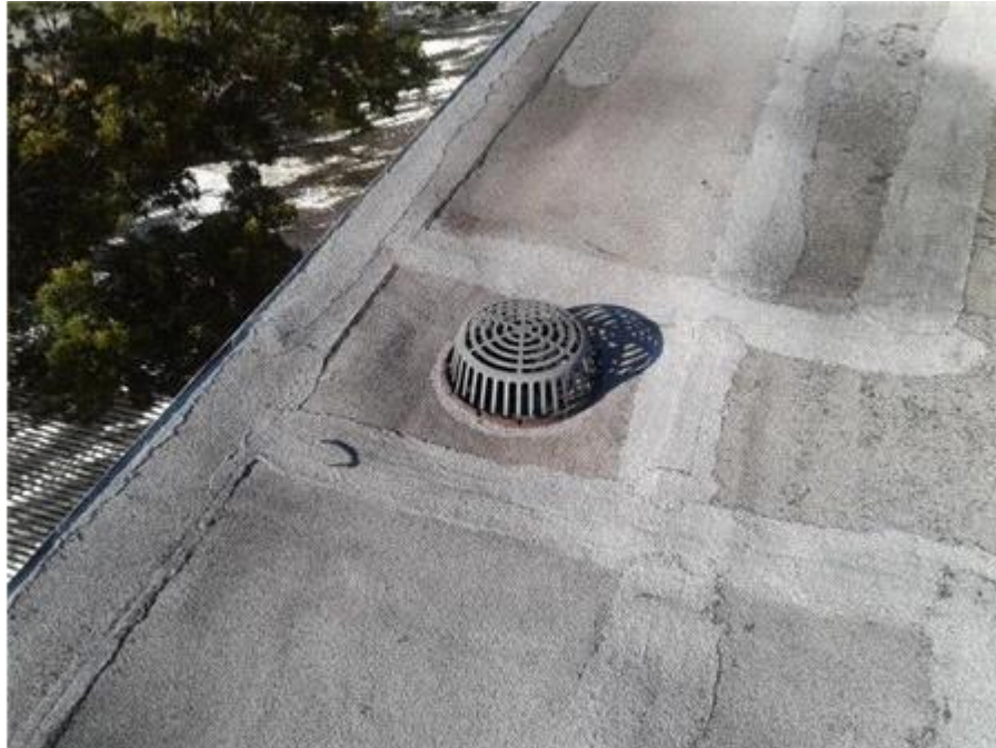
020F- The Towers - BUR - Roof Drains

Roof drains appear to be in fair condition.