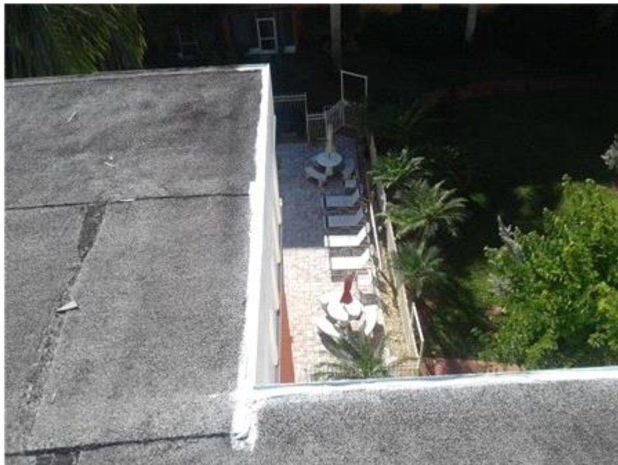
015- The Towers - BUR - Sealant Repair

Sealant should be removed and replaced to prevent water entry.