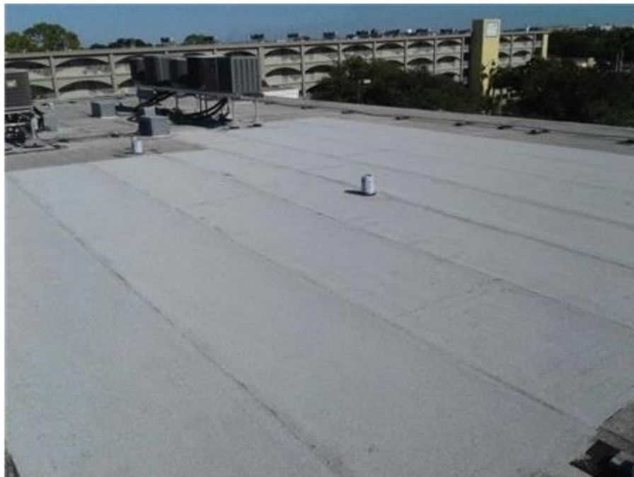
The Towers - BUR - Overlay

The appearance of the roof is in fair condition at this time.