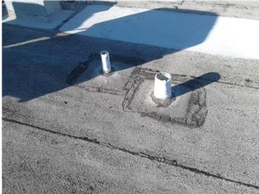
019F - The Towers - BUR - Lead Boots Lead boots appear to be in fair condition.