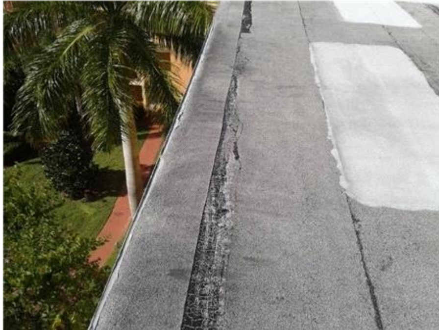
028- The Towers - BUR - Sealant Deterioration/Failure

Sealant should be removed and replaced to prevent water entry.