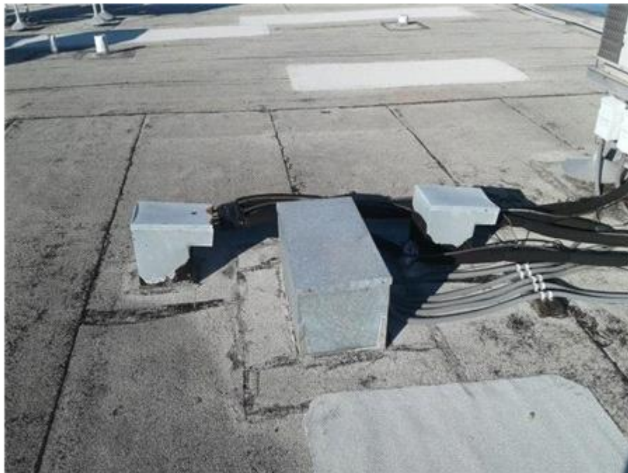
010F- The Towers - BUR - Equipment Housing The equipment housing appears to be in fair condition.