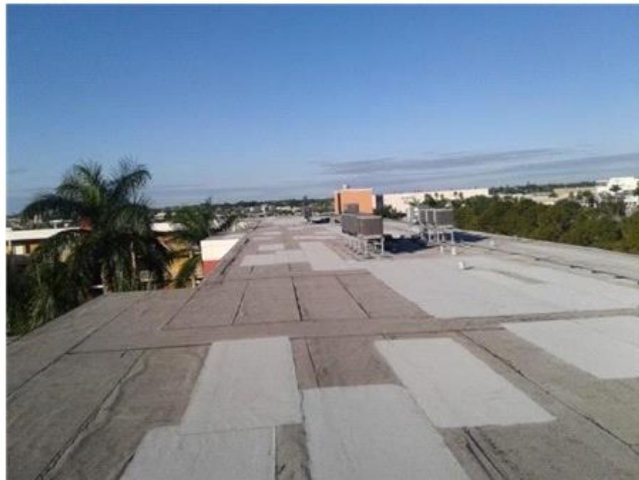
029- The Towers - BUR - Roof Overview General roof overview.