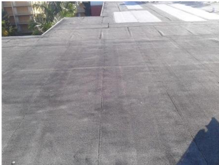
003F - The Towers - BUR - Membrane Overview

The roof membrane appears to be in fair condition at this time.