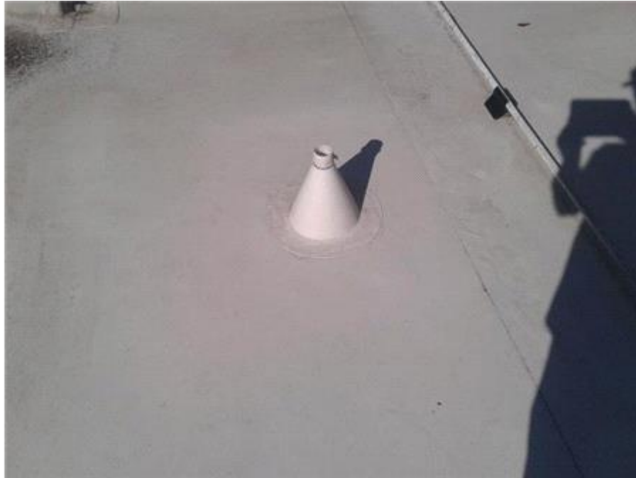
TPO Roof - Soil Stacks

Soil stack boots appear to be in good condition at this time.