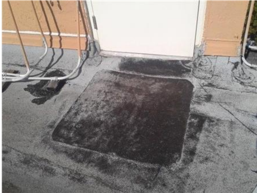
F-236 The Towers - BUR - Field Walkway

Walkway is needed to prevent roof system damage from foot traffic.