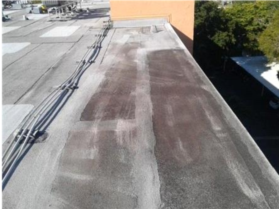
F-247R- The Towers - BUR - Loose Granules

Removed the loose granules from the roof surface, and disposed of properly.