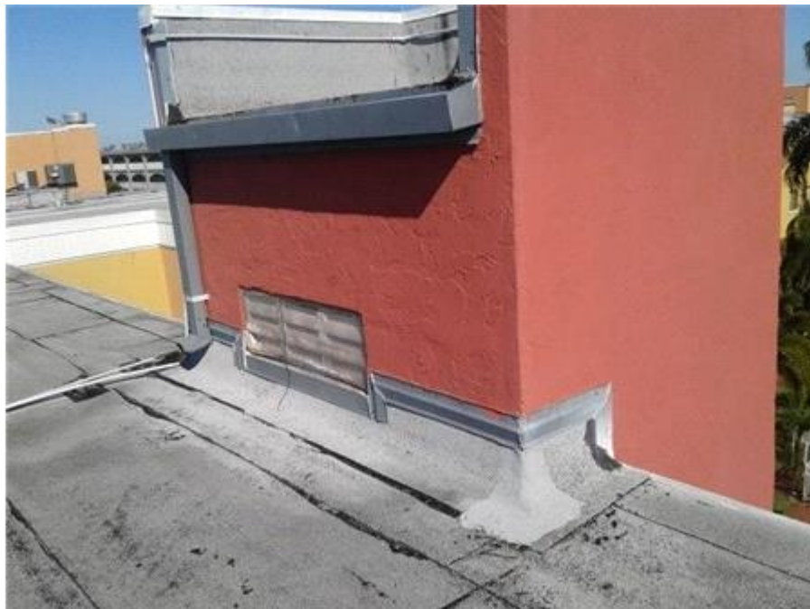
004F - The Towers - BUR - Base Flashings

The gutters appear to be in fair condition.