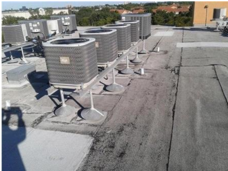
002F - The Towers - BUR - Appearance Overview

Roof drains appear to be in fair condition.