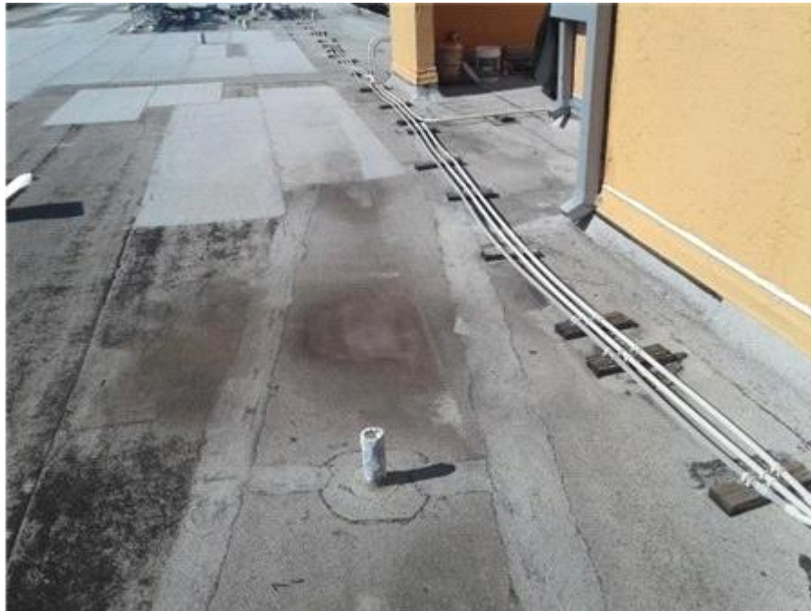
F-247R- The Towers - BUR - Loose Granules

Removed the loose granules from the roof surface, and disposed of properly.