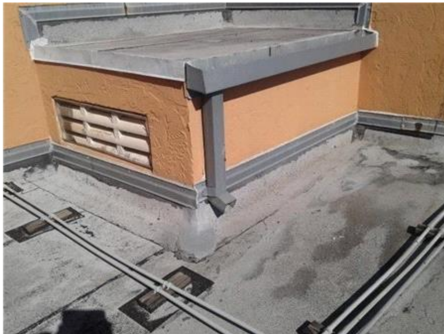
004F - The Towers - BUR - Base Flashings The base flashings appear to be in fair condition.