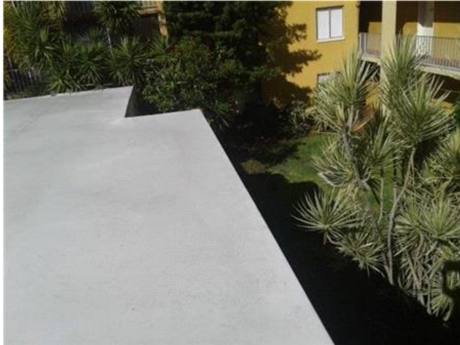
016G- TPO Roof - Roof Edge

Roof edge appears to be in good condition.