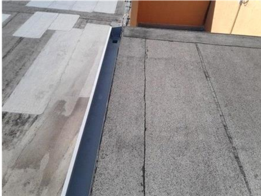
008F- The Towers - BUR - Gutters

The gutters appear to be in fair condition.