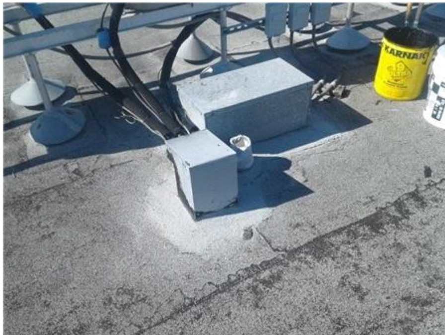
The Towers - BUR - Equipment Housing

Removed the loose granules from the roof surface, and disposed of properly.