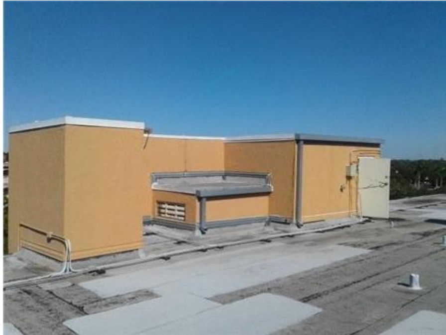
The Towers - BUR Elevator Shaft/Stairwell Roof Building Identification