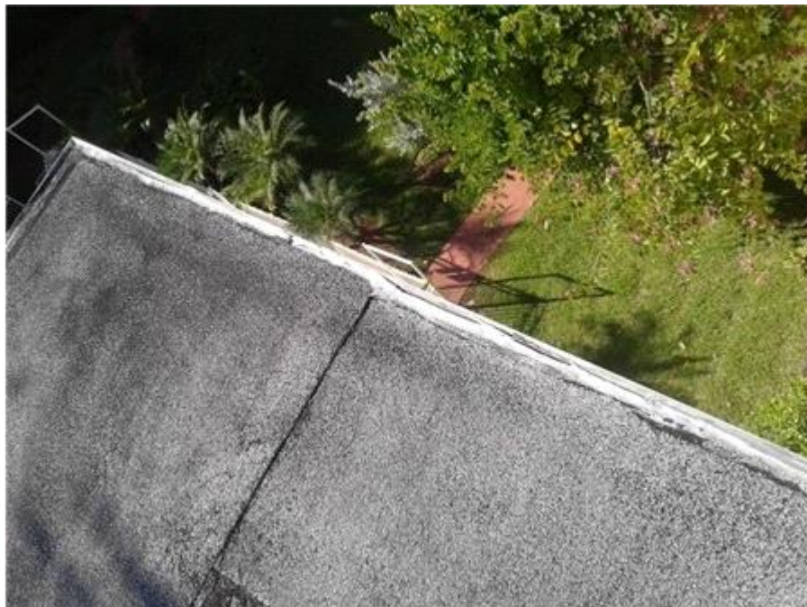
028- The Towers - BUR - Sealant Deterioration/Failure

Removed the loose granules from the roof surface, and disposed of properly.