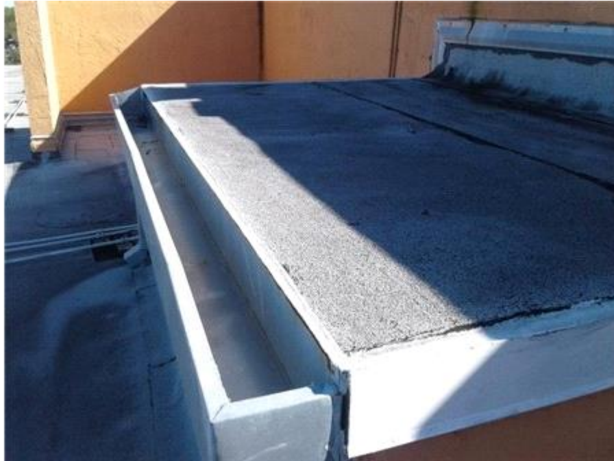
008F- The Towers - BUR - Gutters

The gutters appear to be in fair condition.