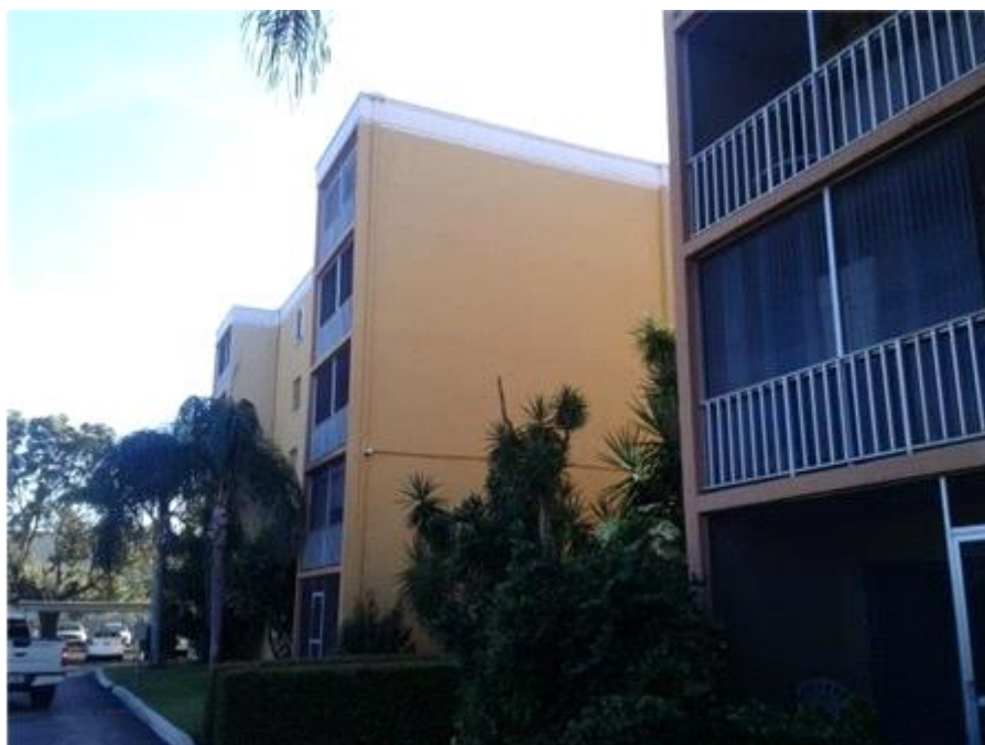
009G- The Towers - BUR - Downspouts

The downspouts appear to be in good condition.