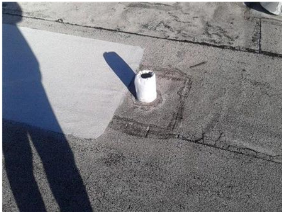
019F- The Towers - BUR - Lead Boots

The base flashings appear to be in fair condition.