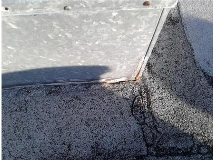
028- The Towers - BUR - Sealant Deterioration/Failure

Sealant should be removed and replaced to prevent water entry.