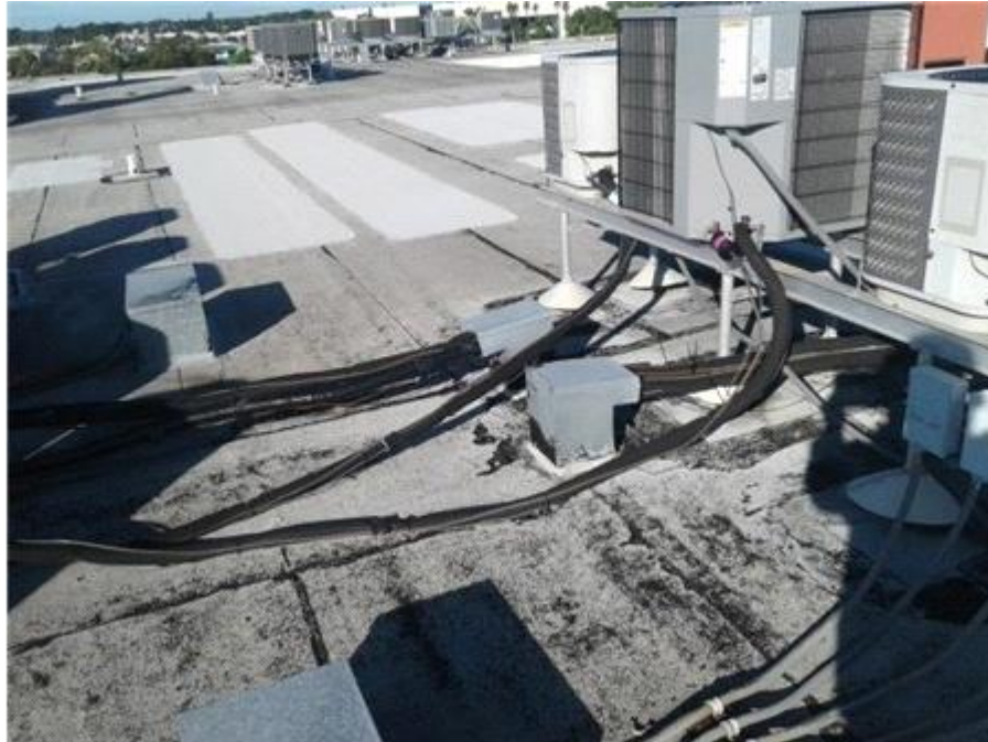
010F- The Towers - BUR - Equipment Housing

The equipment housing appears to be in fair condition.