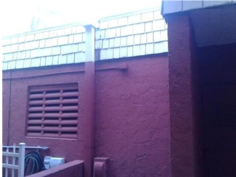
009G- TPO Roof - Downspouts

The downspouts appear to be in good condition.