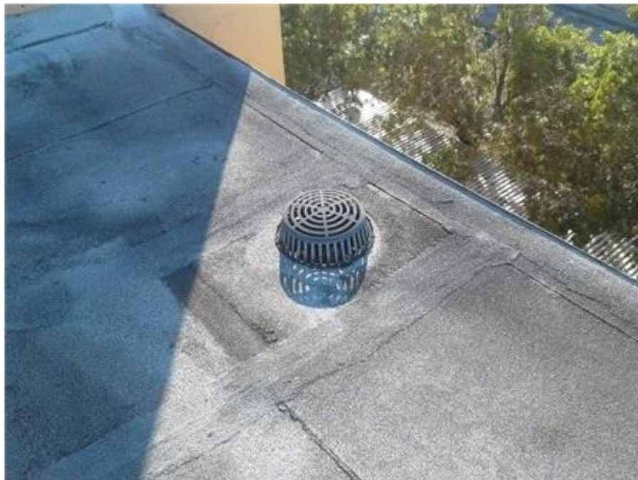
020F- The Towers - BUR - Roof Drains

The equipment housing appears to be in fair condition.