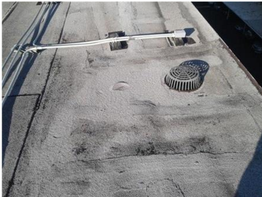
F-247- The Towers - BUR - Loose Granules

Sealant should be removed and replaced to prevent water entry.