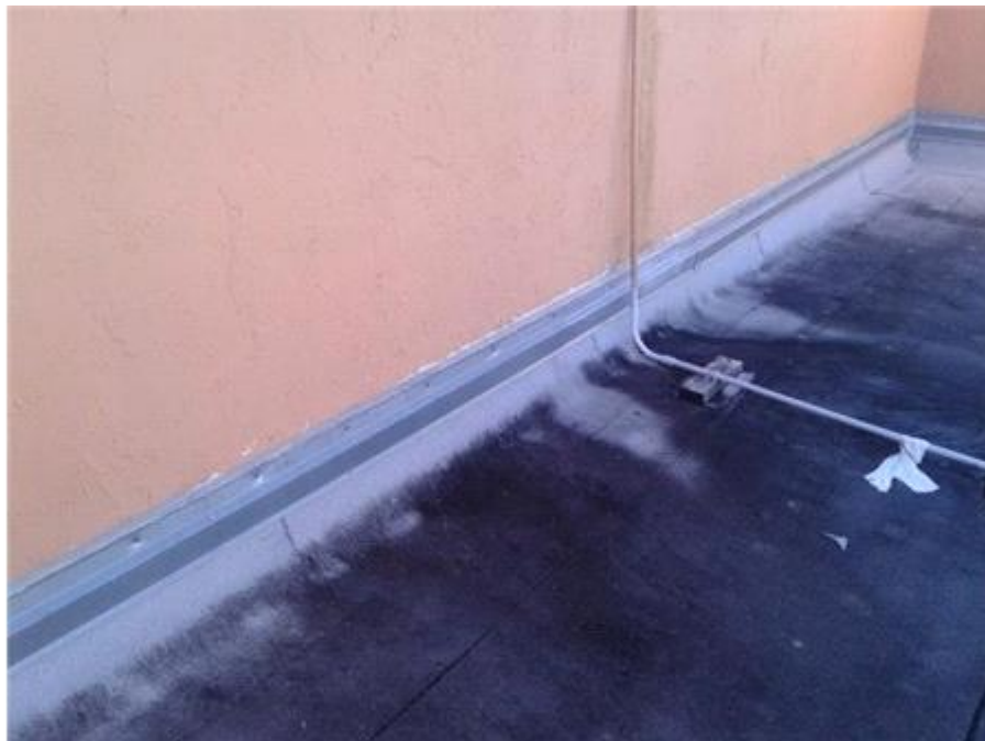
005G- The Towers - BUR - Counter Flashing

The counter flashing appears to be in fair condition.