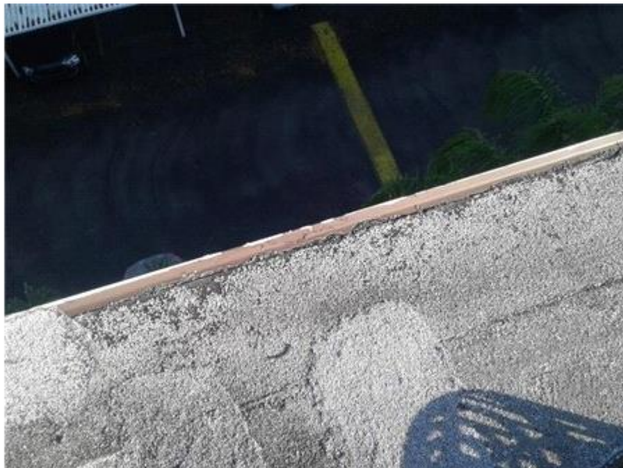
028- The Towers - BUR - Sealant Deterioration/Failure

Removed the loose granules from the roof surface, and disposed of properly.