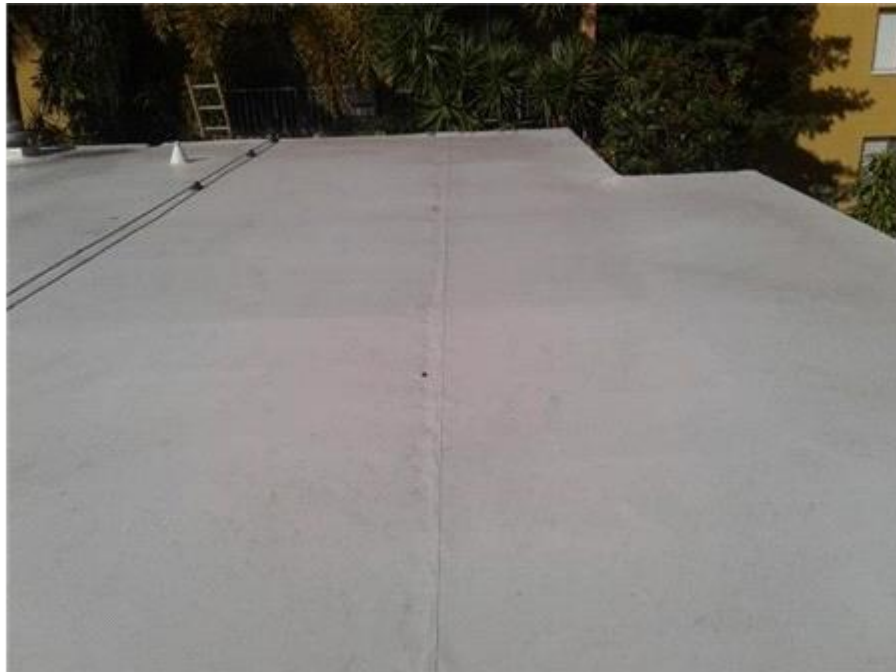
003G - TPO Roof - Membrane Overview

The membrane appears to be in good, maintainable condition at this time.