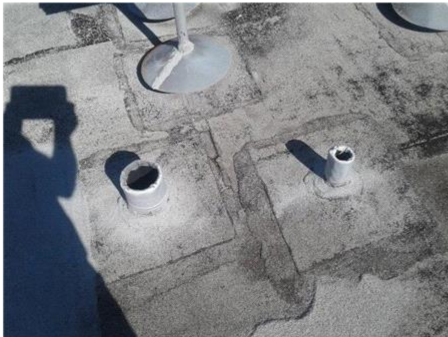
The Towers - BUR - Lead Boots

Re-sealed base of lead boot with roof cement and granules.