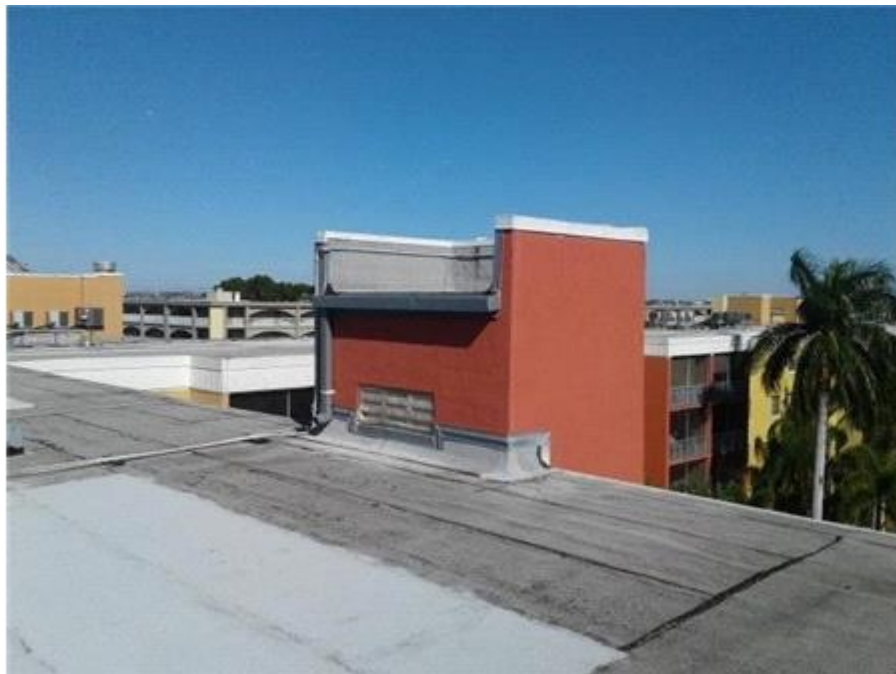
The Towers - BUR - Elevator Shaft Roof

The roof membrane appears to be in fair condition at this time.