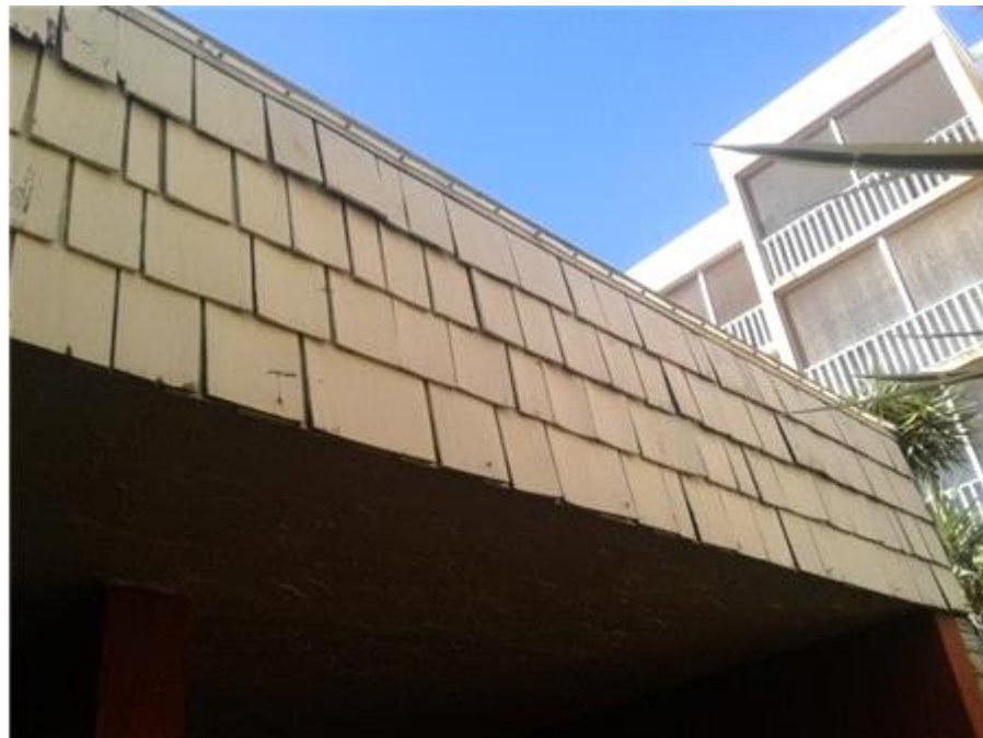
TPO Roof - T-Bar

The downspouts appear to be in good condition.