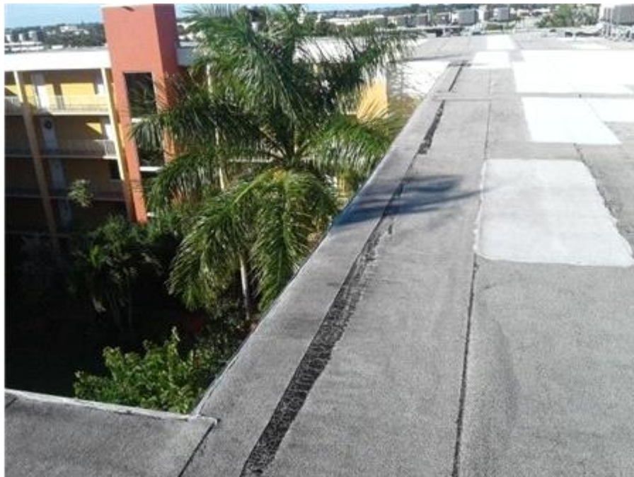
016F- The Towers - BUR - Roof Edge

Roof edge appears to be in fair condition.