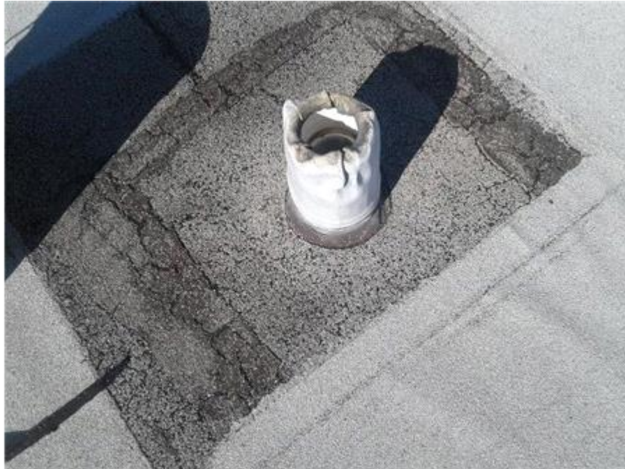
028- The Towers - BUR - Sealant Deterioration/Failure

Sealant should be removed and replaced to prevent water entry.