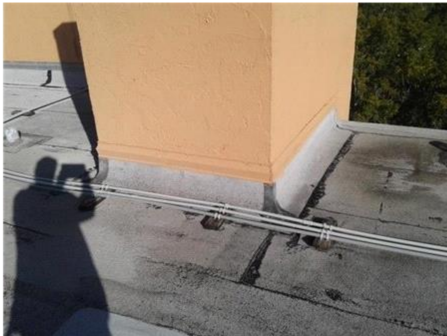
004F - The Towers - BUR - Base Flashings

The roof surface appears to be in fair condition at this time.