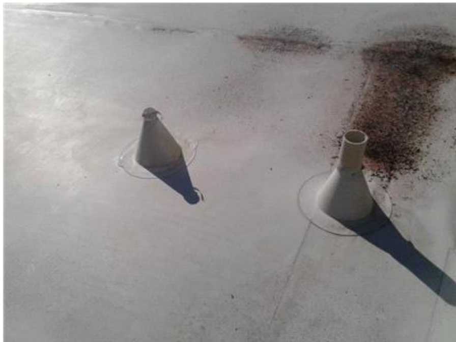
TPO Roof - Soil Stacks

Soil stack boots appear to be in good condition at this time.