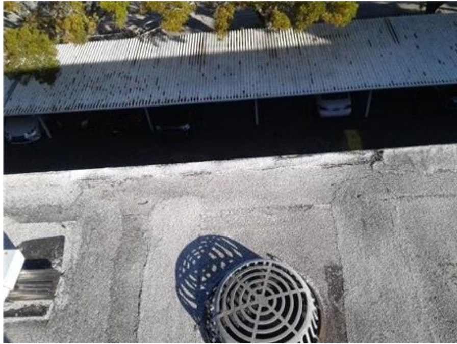
015- The Towers - BUR - Sealant Repair

Removed existing sealant and replaced with roof cement and granules.