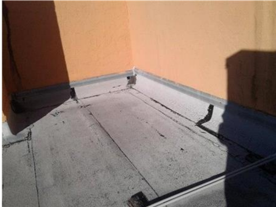
004F - The Towers - BUR - Base Flashings

The base flashings appear to be in fair condition.