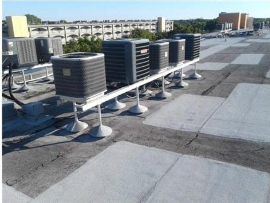
002F - The Towers - BUR - Appearance Overview

The appearance of the roof is in fair condition at this time.