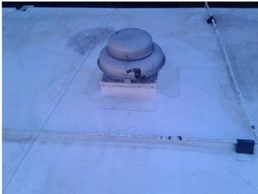
004G - TPO Roof - Base Flashings

The roof surface appears to be in good, maintainable condition at this time.