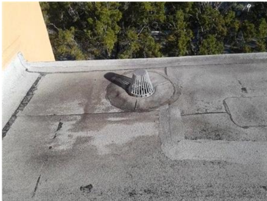
020F- The Towers - BUR - Roof Drains

The appearance of the roof is in fair condition at this time.