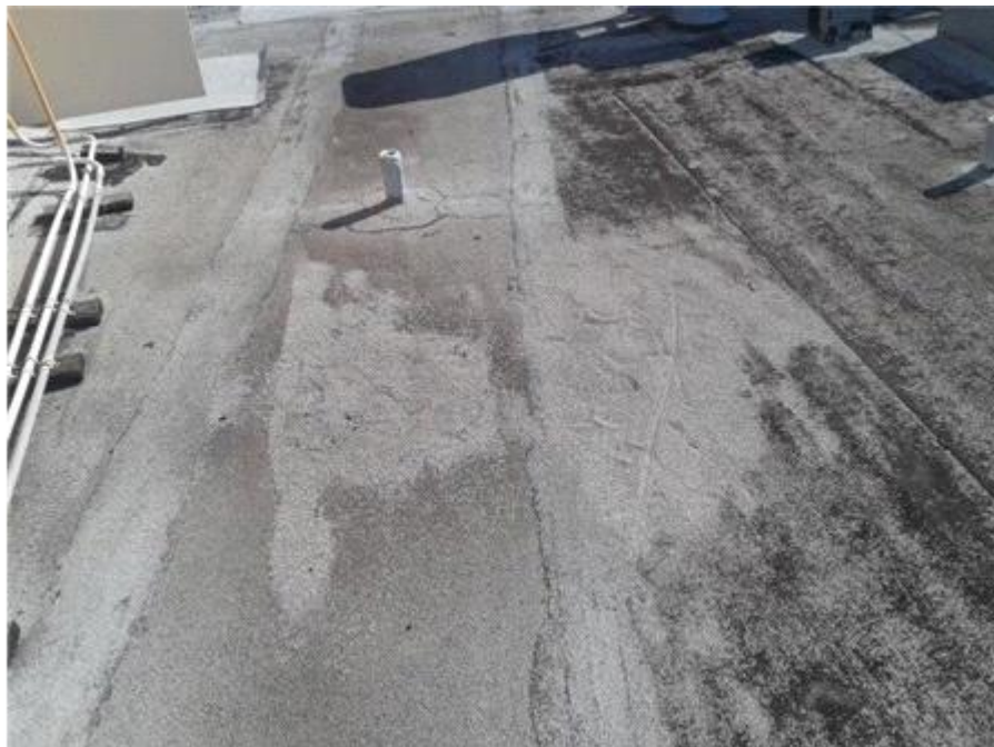
F-247- The Towers - BUR - Loose Granules

Identified loose granules on the roof surface.