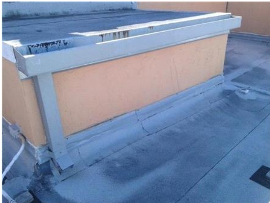
004F - The Towers - BUR - Base Flashings

The base flashings appear to be in fair condition.