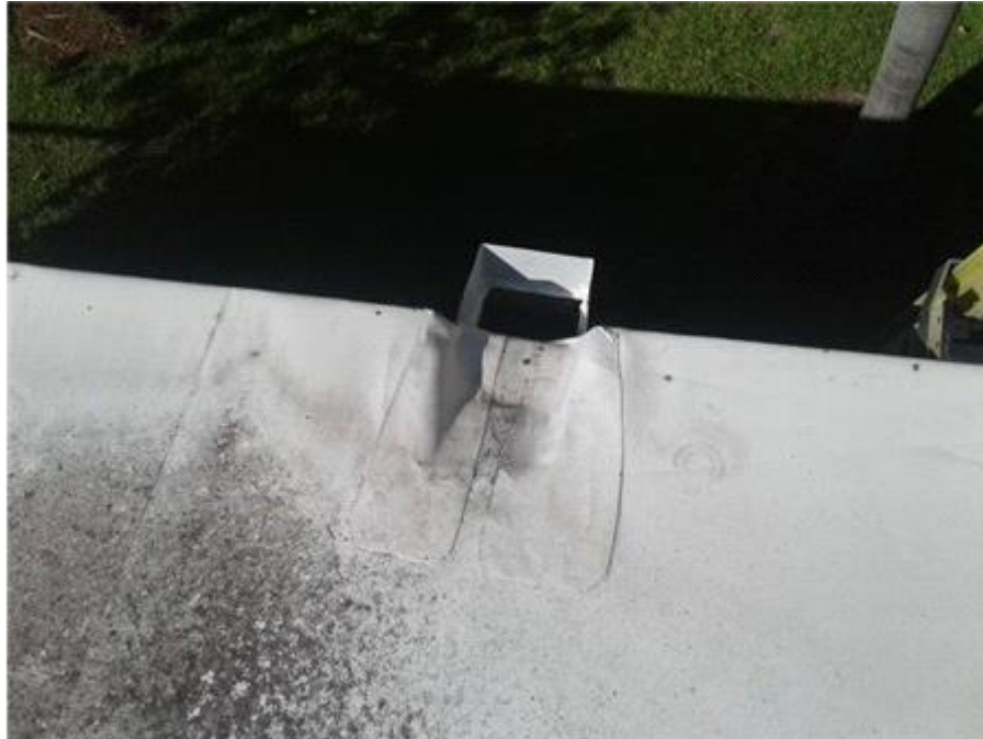
TPO Roof - Scuppers

Scuppers appear to be in good condition at this time.