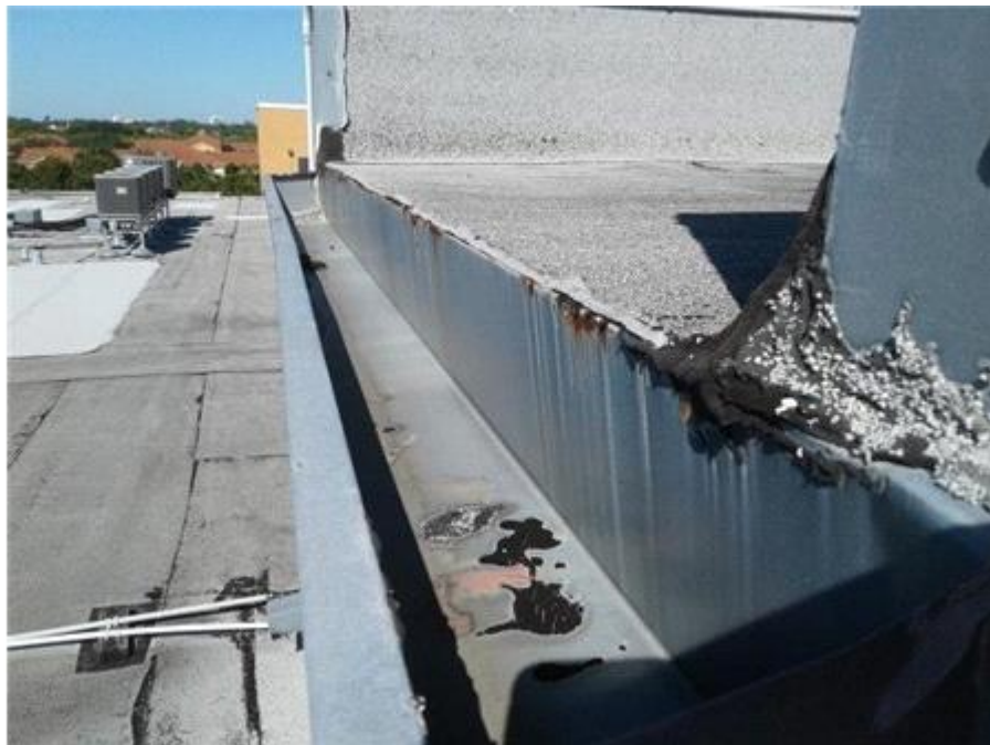
008F- The Towers - BUR - Gutters

The appearance of the roof is in fair condition at this time.