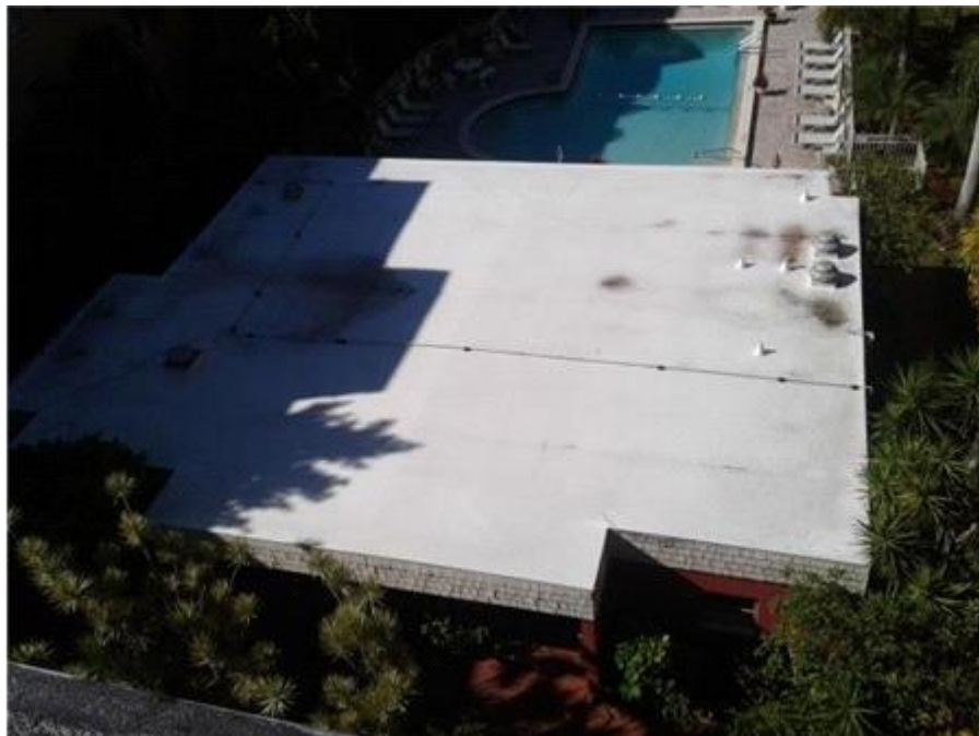
029- TPO Roof - Roof Overview