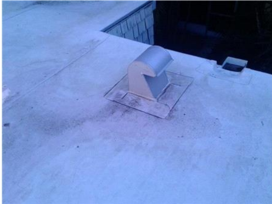
002G- TPO Roof - Roof Vents

Roof vents appear to be in good condition at this time.