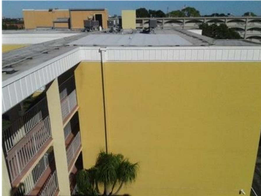
009G- The Towers - BUR - Downspouts

The downspouts appear to be in good condition.