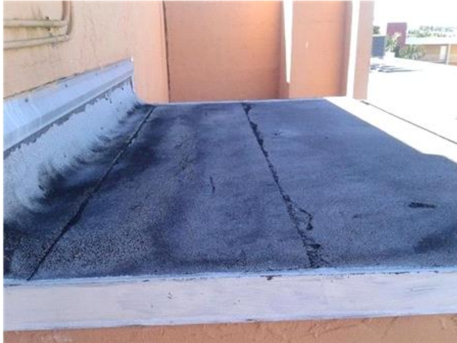
003F - The Towers - BUR - Membrane Overview

The roof membrane appears to be in fair condition at this time.