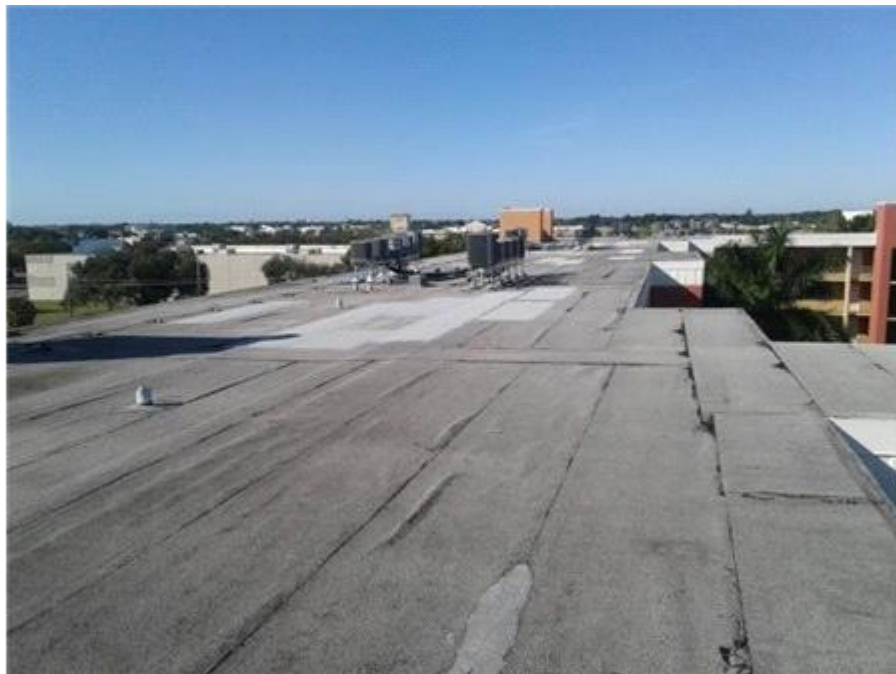
002F - The Towers - BUR - Appearance Overview

Scupper box appears to be in fair condition at this time.