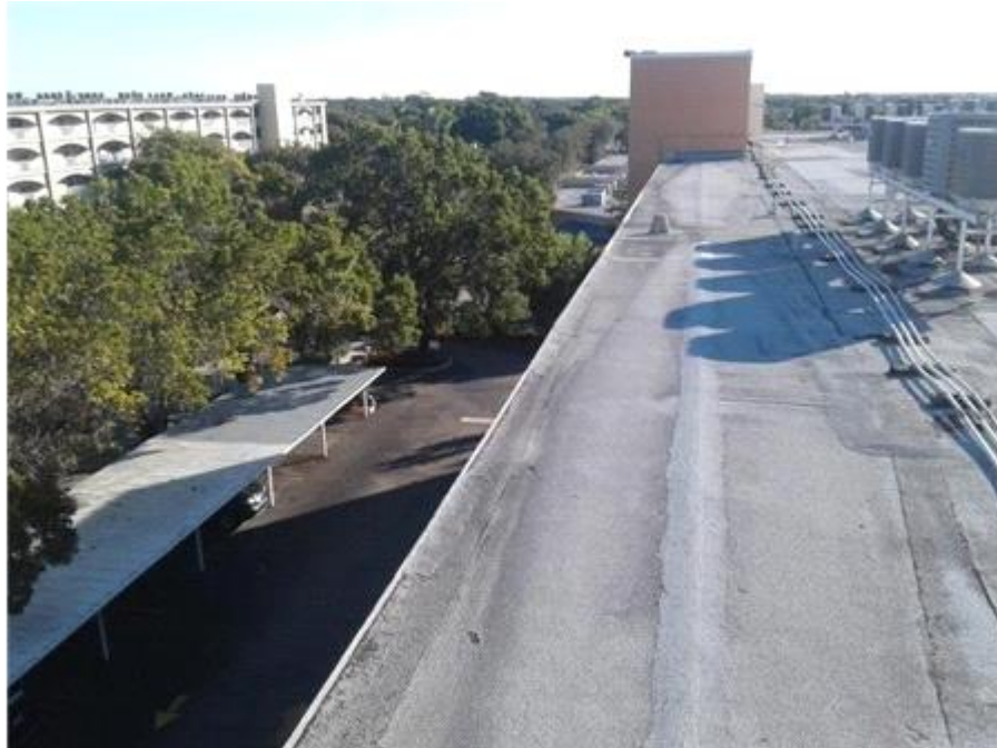
016F- The Towers - BUR - Roof Edge

Roof edge appears to be in fair condition.