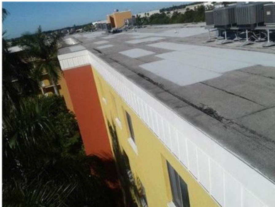
The Towers - BUR Edge Metal/Fascia

Edge metal/fascia appears to be in good condition at this time.