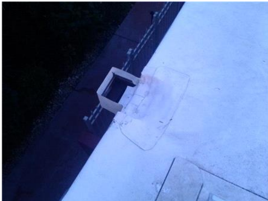
TPO Roof - Scuppers

Roof vents appear to be in good condition at this time.