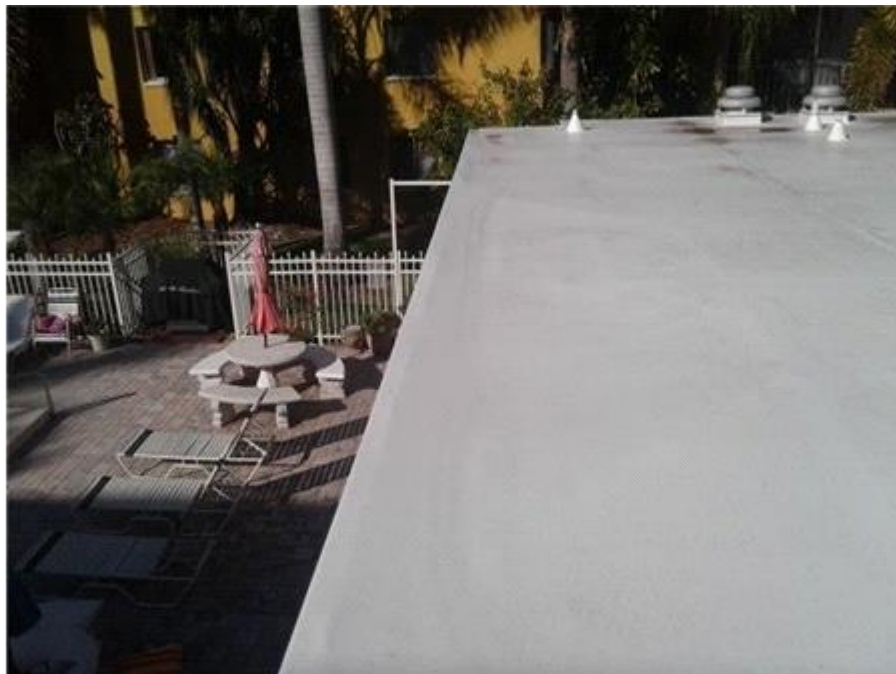
016G- TPO Roof - Roof Edge

Scuppers appear to be in good condition at this time.