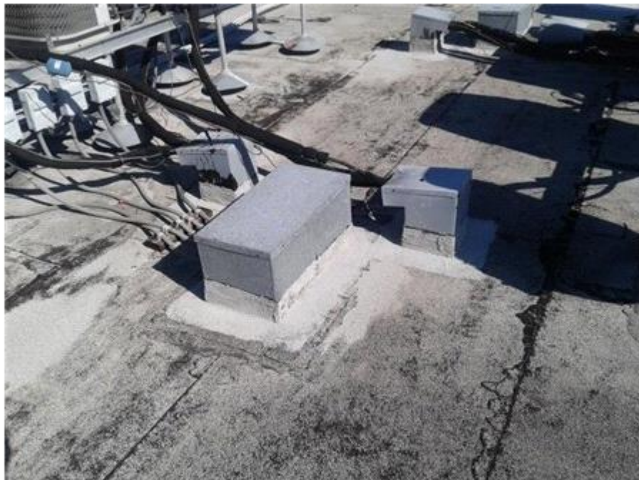
002F - The Towers - BUR - Appearance Overview

The roof surface appears to be in fair condition at this time.