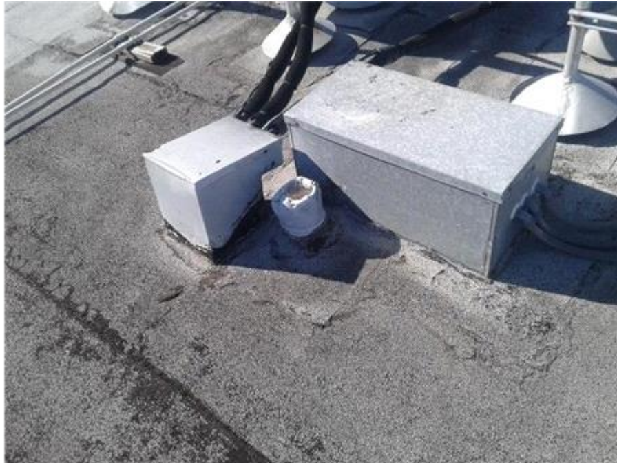
028- The Towers - BUR - Sealant Deterioration/Failure

Sealant should be removed and replaced to prevent water entry.