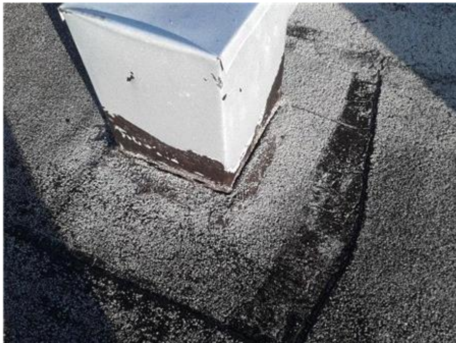
028- The Towers - BUR - Sealant Deterioration/Failure

The downspouts appear to be in good condition.