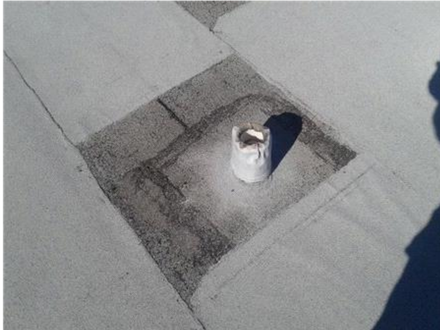
The Towers - BUR - Lead Boot

Re-sealed base of lead boot with roof cement and granules.