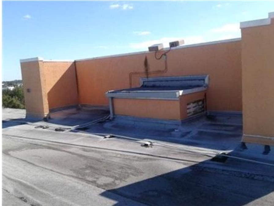
The Towers - BUR - Elevator Shaft Roof