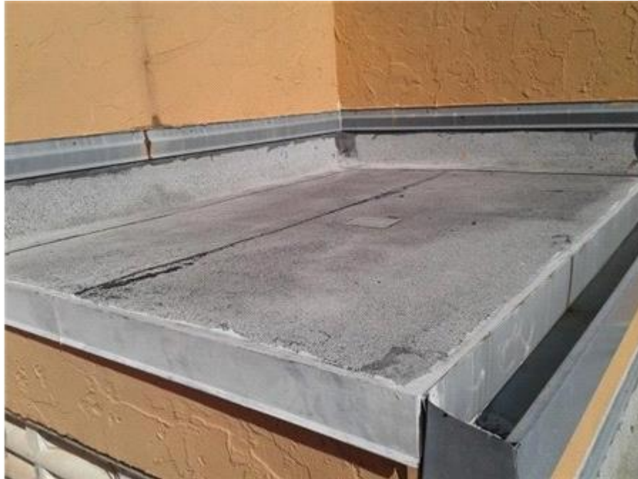
003F - The Towers - BUR - Membrane Overview

The roof membrane appears to be in fair condition at this time.