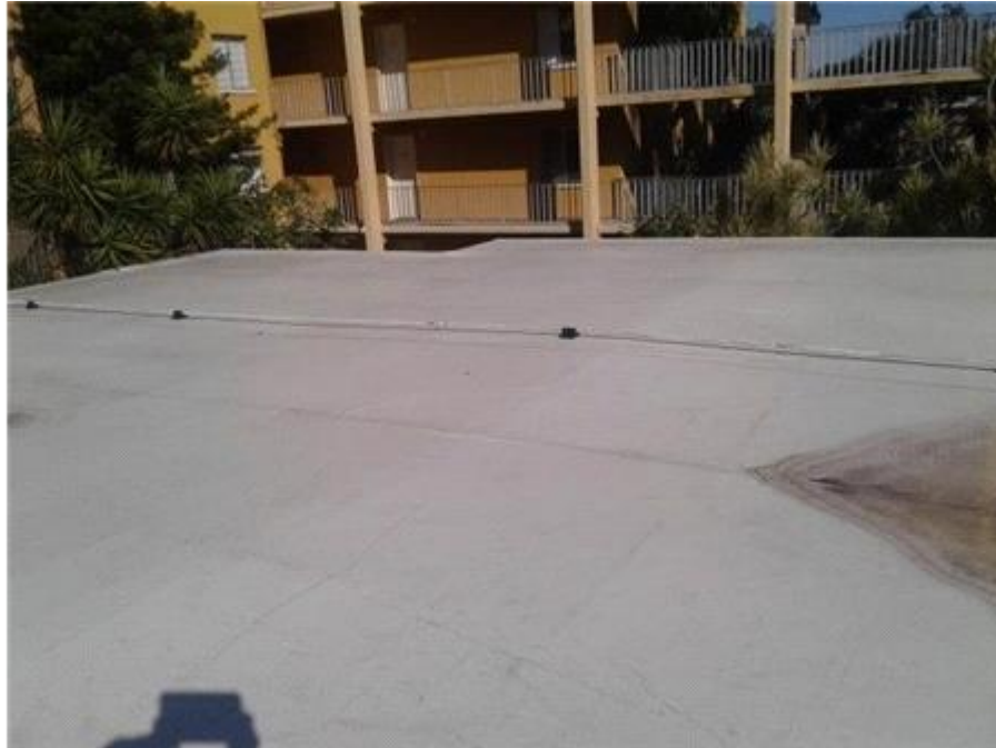
001G- TPO Roof - Surface Overview

The roof surface appears to be in good, maintainable condition at this time.