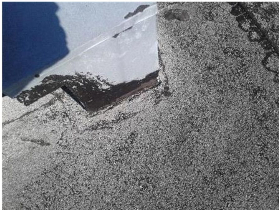
028- The Towers - BUR - Sealant Deterioration/Failure

Sealant should be removed and replaced to prevent water entry.