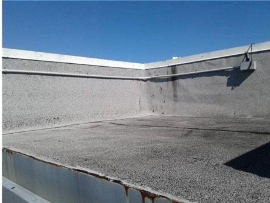
002F - The Towers - BUR - Appearance Overview

The appearance of the roof is in fair condition at this time.