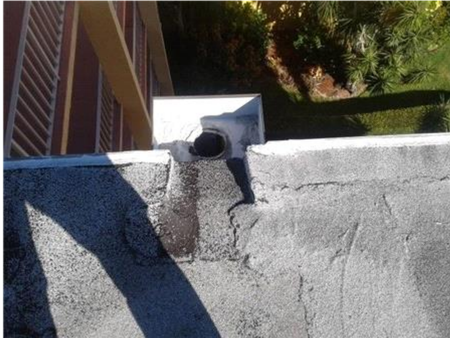
The Towers - BUR - Scupper Box

Scupper box appears to be in fair condition at this time.