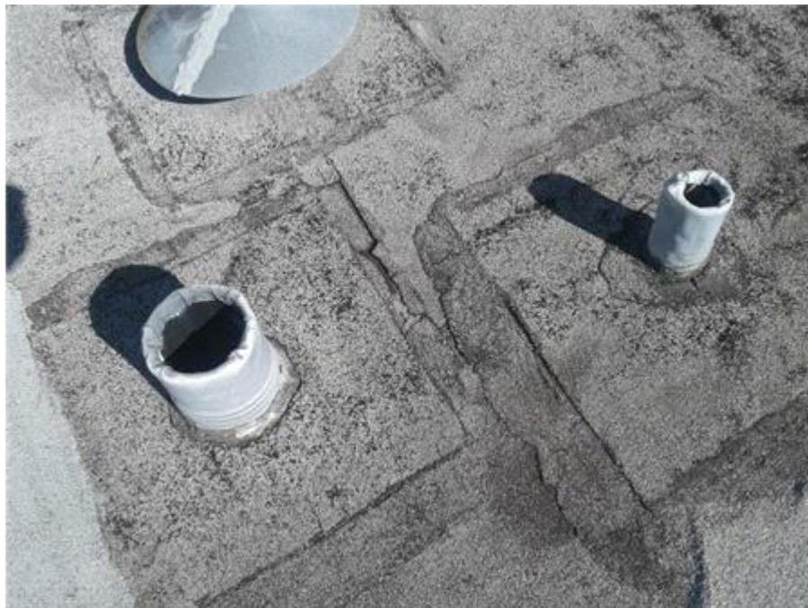
028- The Towers - BUR - Sealant Deterioration/Failure

Sealant should be removed and replaced to prevent water entry.