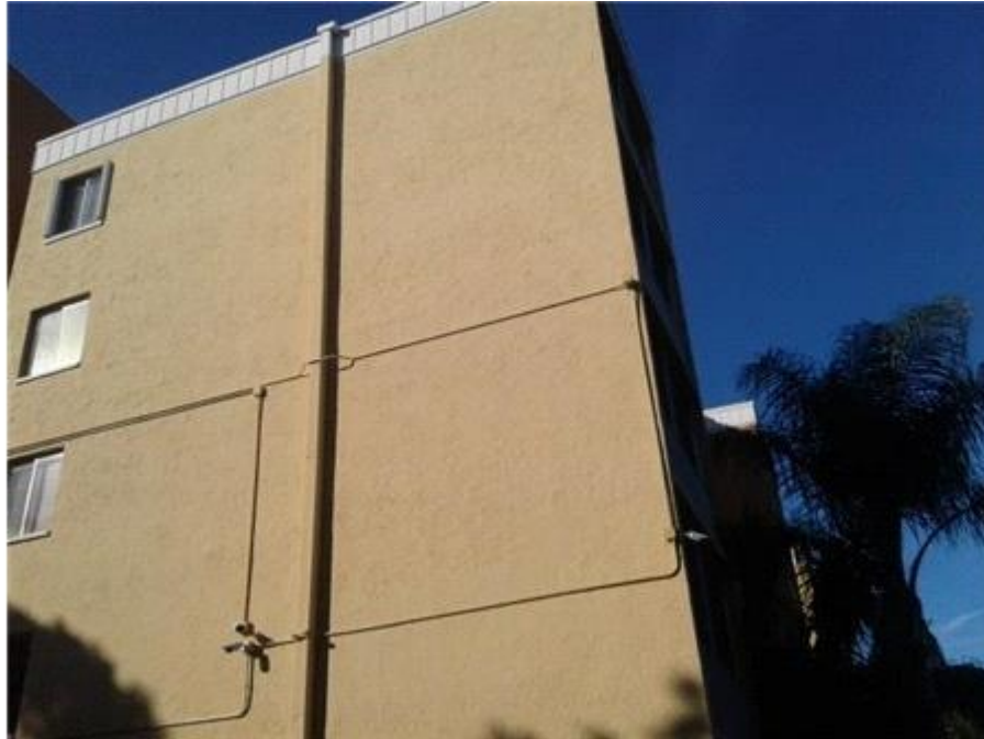
009G- The Towers - BUR - Downspouts

The downspouts appear to be in good condition.