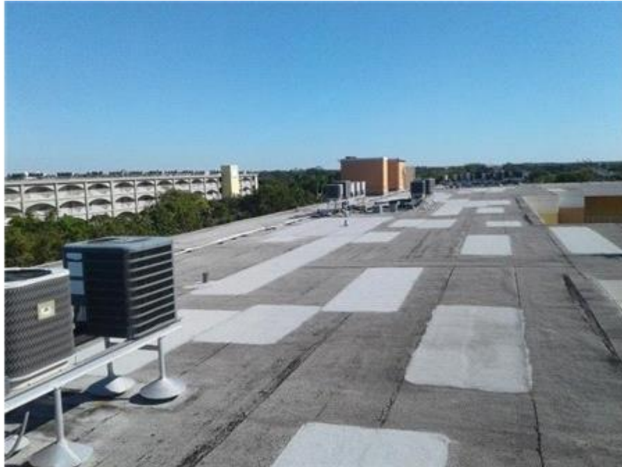
002F - The Towers - BUR - Appearance Overview

The appearance of the roof is in fair condition at this time.