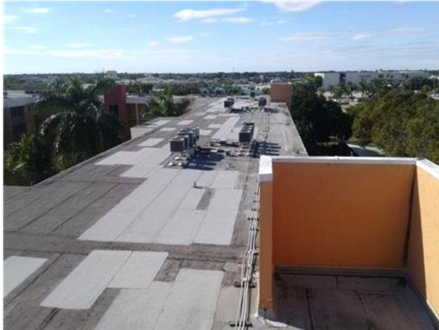
029- The Towers - BUR - Roof overview