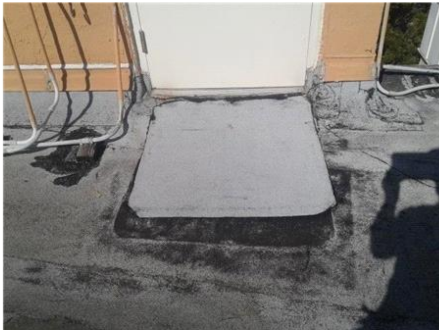
The Towers - BUR - Field Walkway

Walkway is needed to prevent roof system damage from foot traffic.