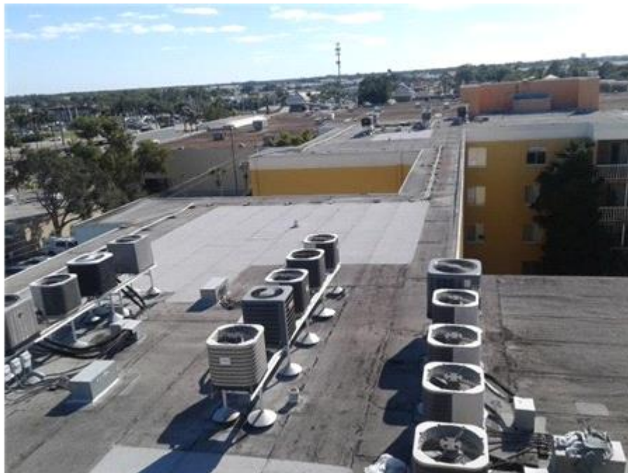
029- The Towers - BUR - Roof Overview