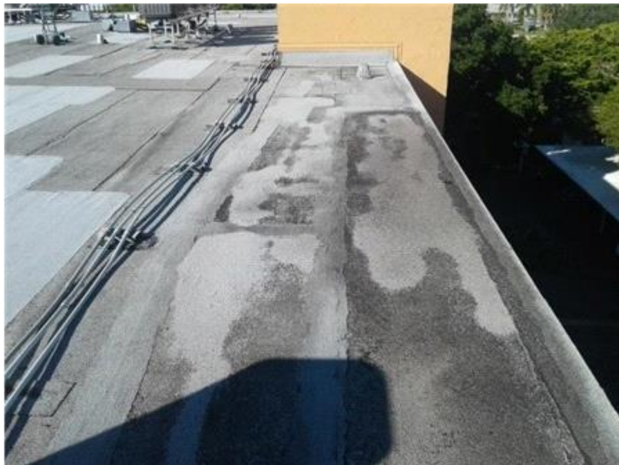
F-247- The Towers - BUR - Loose Granules

Removed existing sealant and replaced with roof cement and granules.