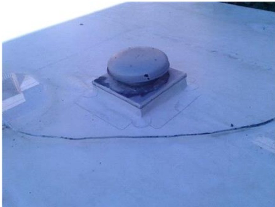
004G - TPO Roof - Base Flashings

Roof vents appear to be in good condition at this time.