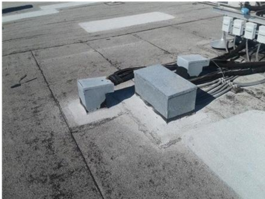
The Towers - BUR - Equipment Housing

Removed existing sealant and replaced with M1 sealant.