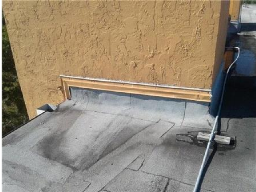
005F- The Towers - BUR - Counter Flashing

The counter flashing appears to be in fair condition.