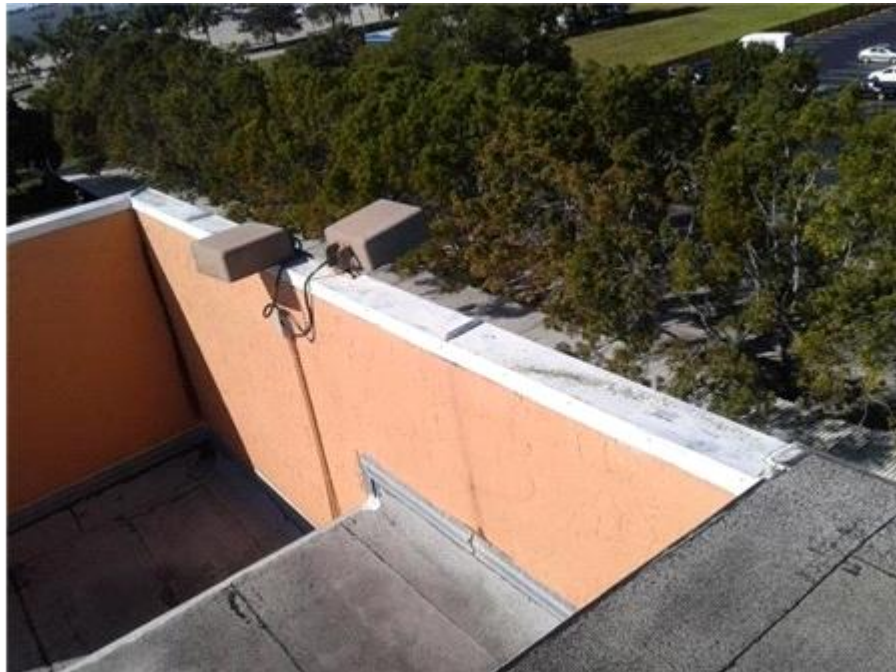
006F- The Towers - BUR - Coping

The gutters appear to be in fair condition.