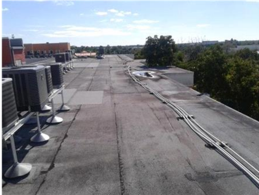
001F - The Towers - BUR - Surface Overview

The roof surface appears to be in fair condition at this time.