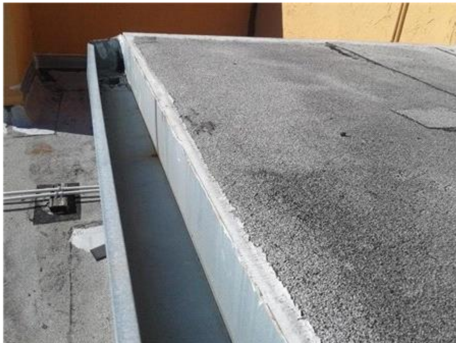
008F- The Towers - BUR - Gutters

The roof membrane appears to be in fair condition at this time.