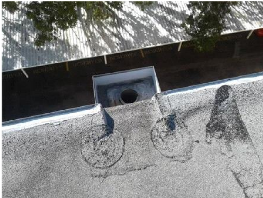
The Towers - BUR - Scupper Box

The downspouts appear to be in good condition.