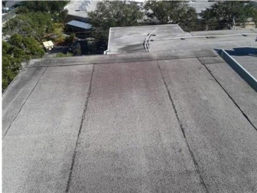
003F - The Towers - BUR - Membrane Overview-Stairwell Roof

The roof membrane appears to be in fair condition at this time.