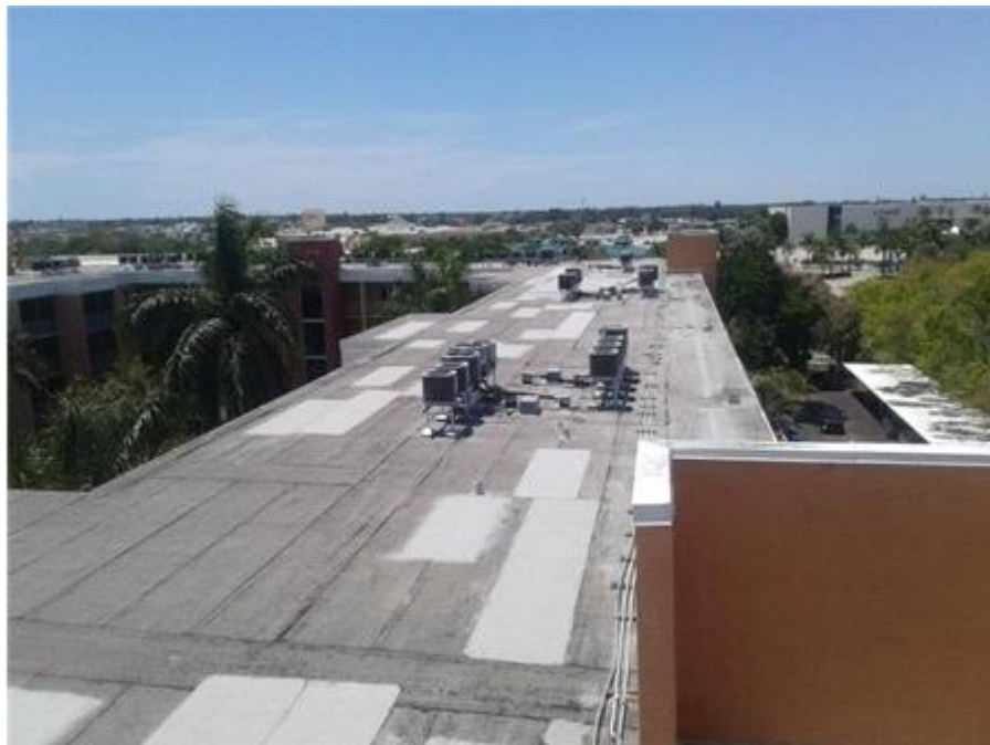
029- The Towers - BUR Roof Overview

The gutters appear to be in good condition.