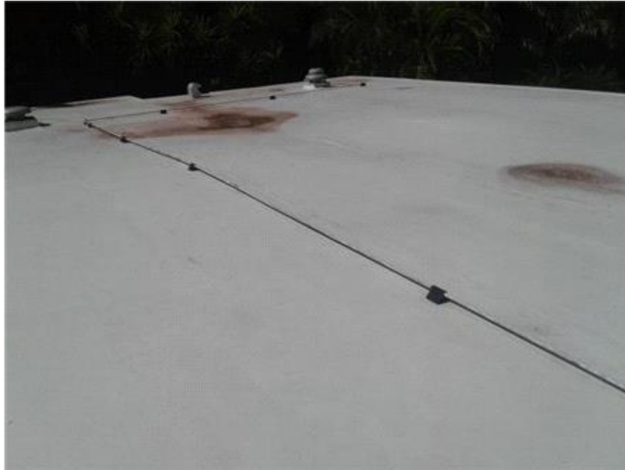
003G - The Towers - TPO Roof Membrane Overview

The membrane appears to be in good, maintainable condition at this time.