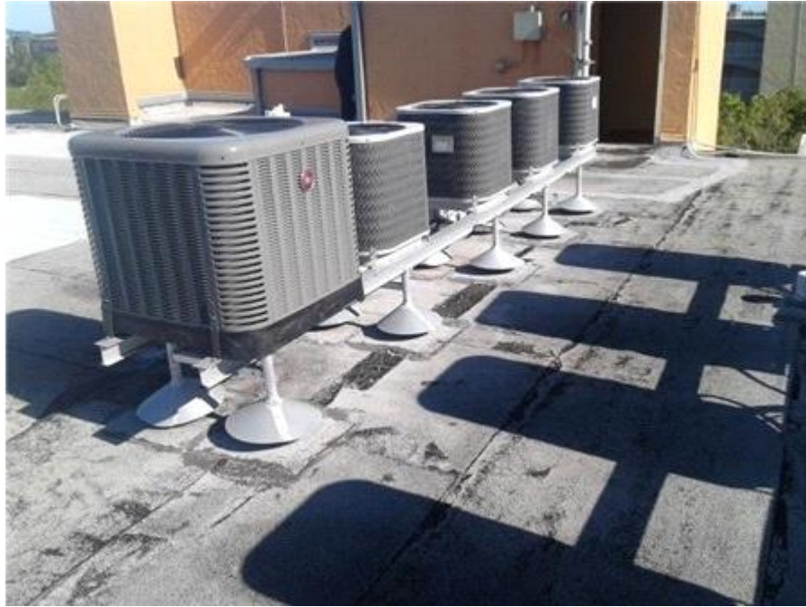
002F - The Towers - BUR Appearance Overview

The appearance of the roof is in fair condition at this time.