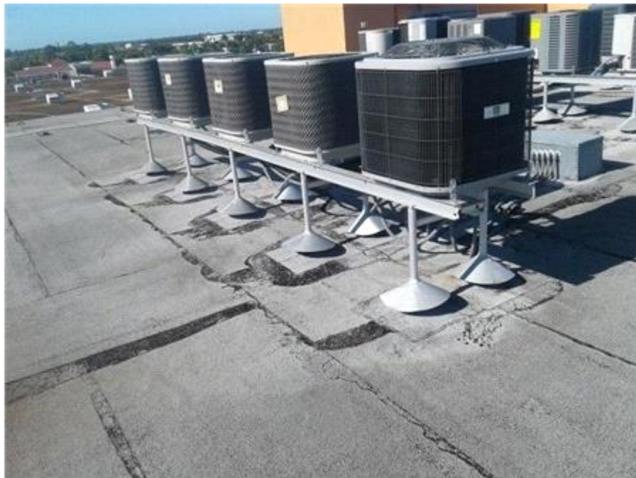
002F - The Towers - BUR Appearance Overview

The counter flashing appears to be in fair condition.