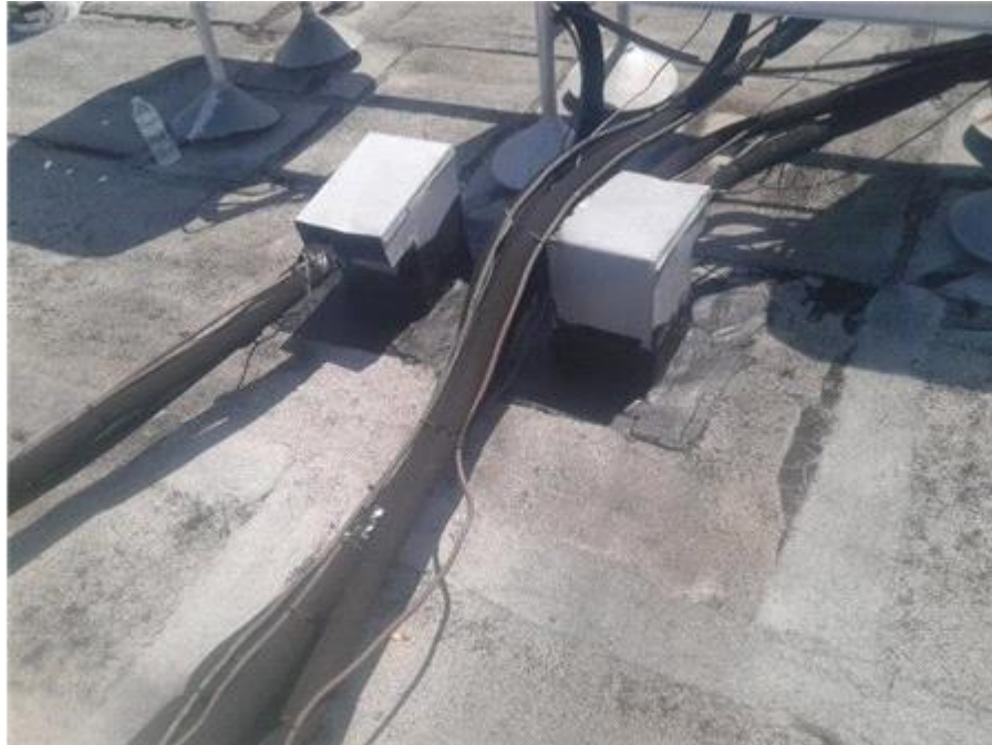
The Towers - BUR Sealant Deterioration/Failure