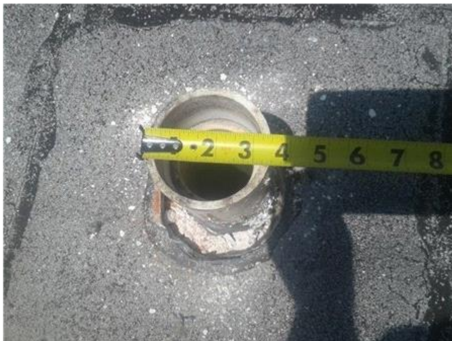
The Towers - BUR Lead Boot