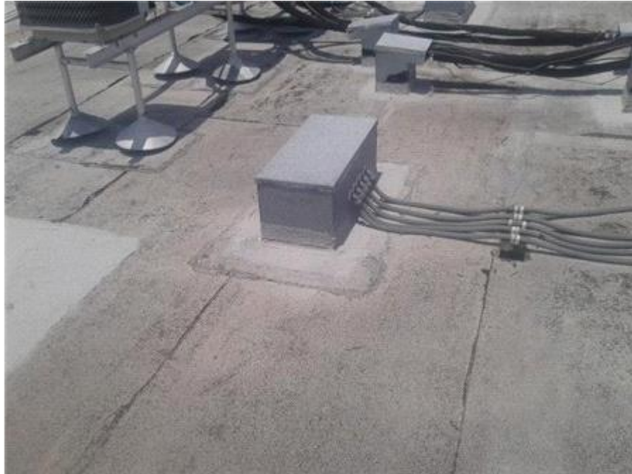
The Towers - BUR Sealant Deterioration/Failure Repairs made by three coursing and granulating.