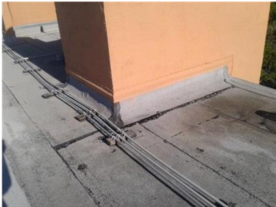
004F - The Towers - BUR Base Flashings

Roof edge appears to be in fair condition.