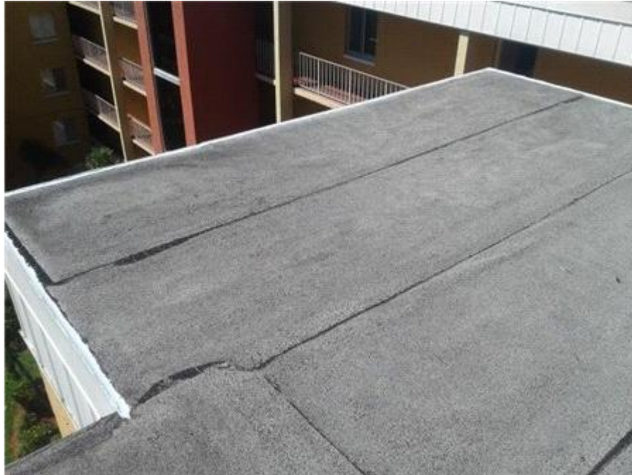
015- The Towers - BUR Sealant Repair

Removed existing sealant and replaced with M-1 sealant.