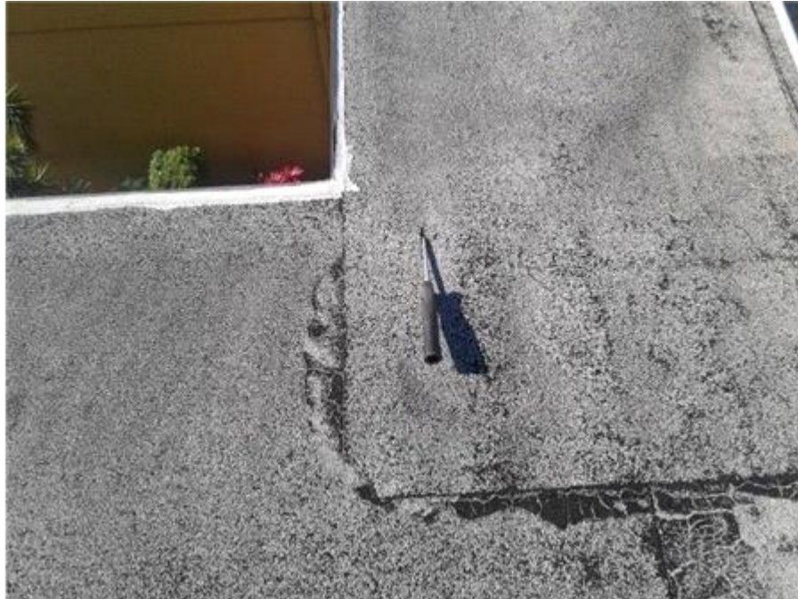
F-102 The Towers - BUR Field Membrane - Puncture

Holes in the membrane are considered high severity due to their high leak potential.