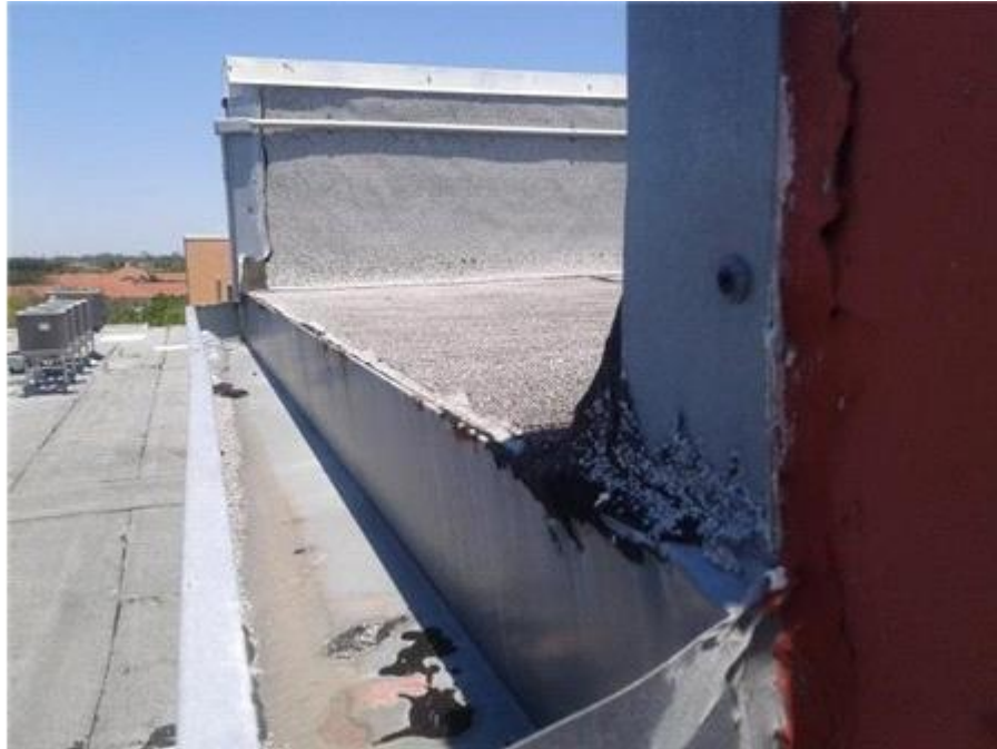
008G- The Towers - BUR Gutters

The gutters appear to be in good condition.