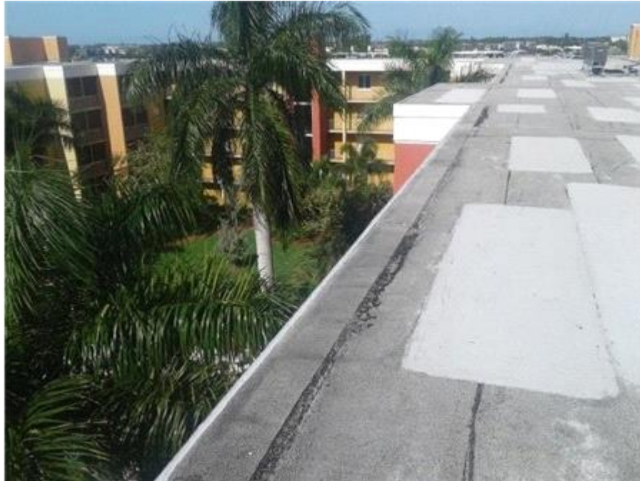
015- The Towers - BUR Sealant Repair

Removed existing sealant and replaced with M-1 sealant - approximately 100'.