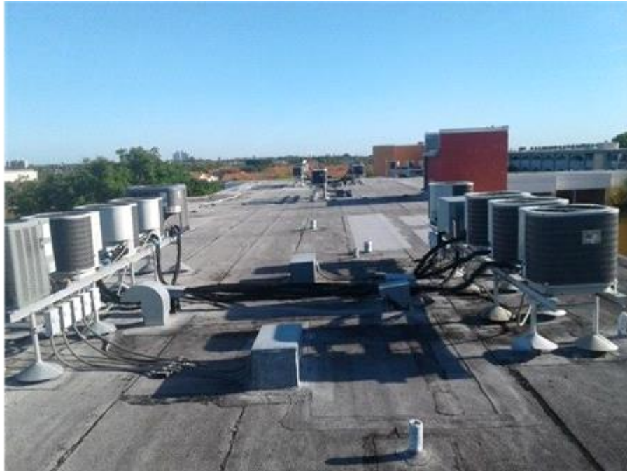
002F - The Towers - BUR Appearance Overview

The appearance of the roof is in fair condition at this time.