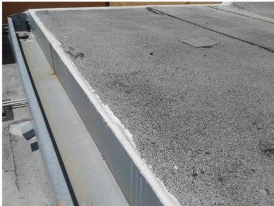
008G- The Towers - BUR Gutters

The roof membrane appears to be in fair condition at this time.