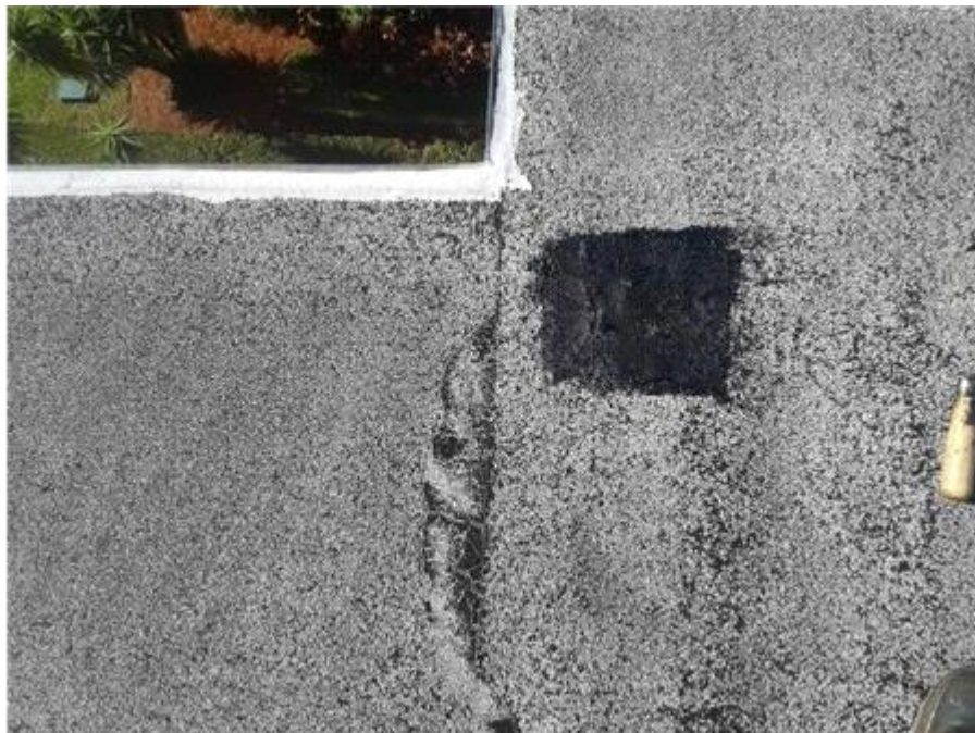
The Towers - BUR Field Membrane - Puncture

Holes in the membrane are considered high severity due to their high leak potential.