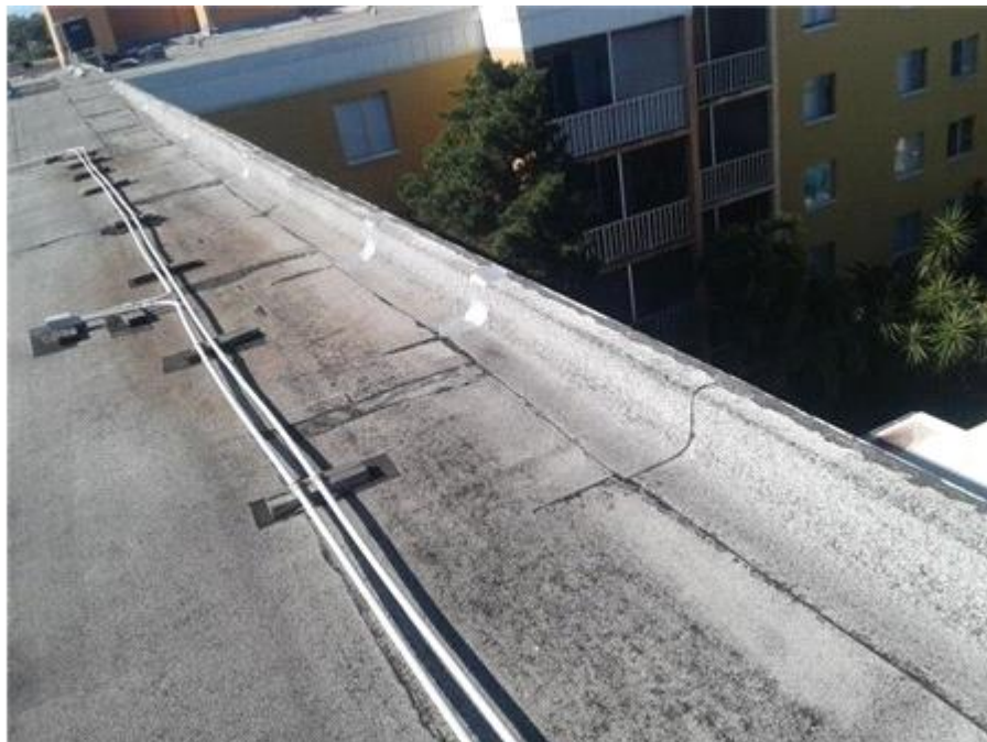
004F - The Towers - BUR Base Flashings

The base flashings appear to be in fair condition.