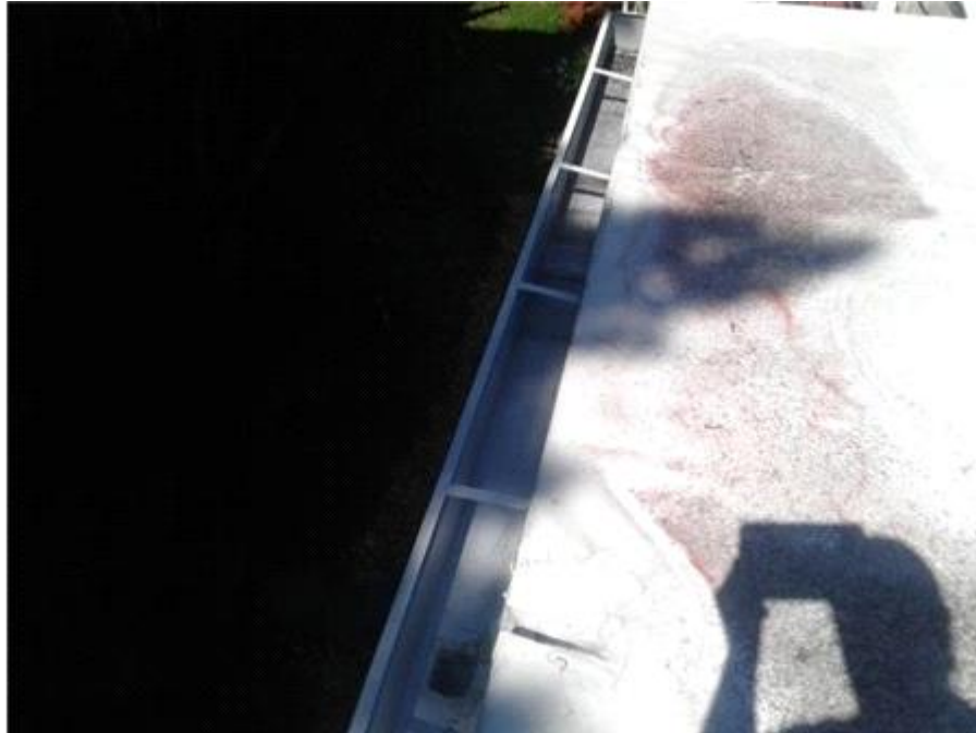
008G- The Towers - TPO Roof Gutters

The gutters appear to be in good condition.