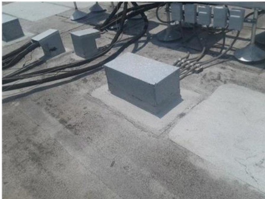
The Towers - BUR Sealant Deterioration/Failure

Removed lead boot and sealed base with M-1 sealant. Crowther Roofing suggests installing a new four (4) inch lead boot. (This repair will be completed as part of the monthly maintenance).