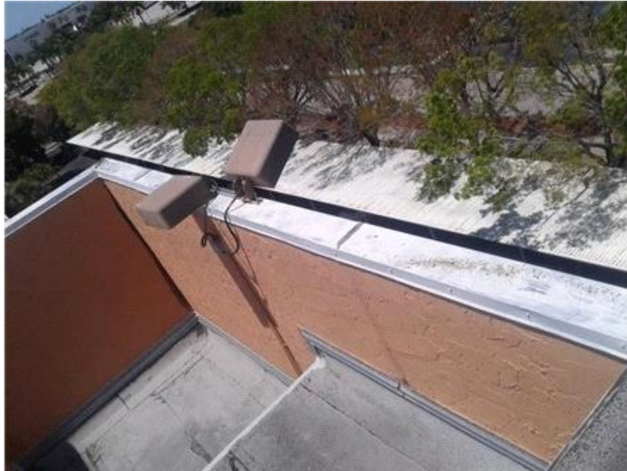
006F- The Towers - BUR Coping

The coping appears to be in fair condition.