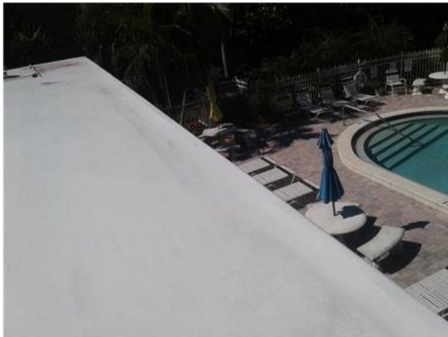
016G- The Towers - TPO Roof Roof Edge

The roof appearance is in good, maintainable condition at this time.