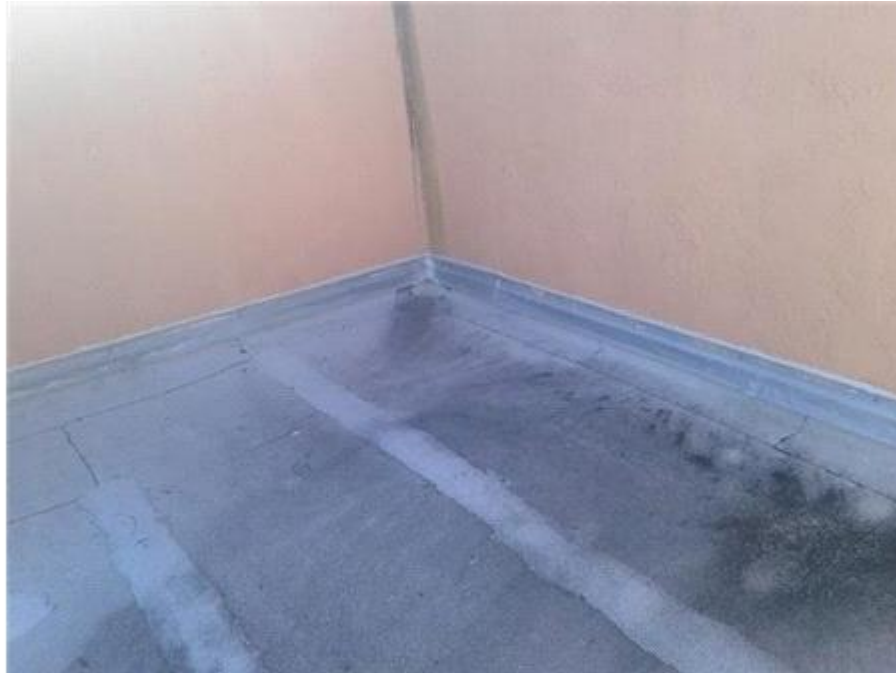
005F- The Towers - BUR Counter Flashing

The counter flashing appears to be in fair condition.