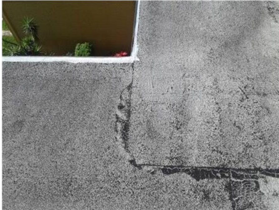
The Towers - BUR Field Membrane - Puncture