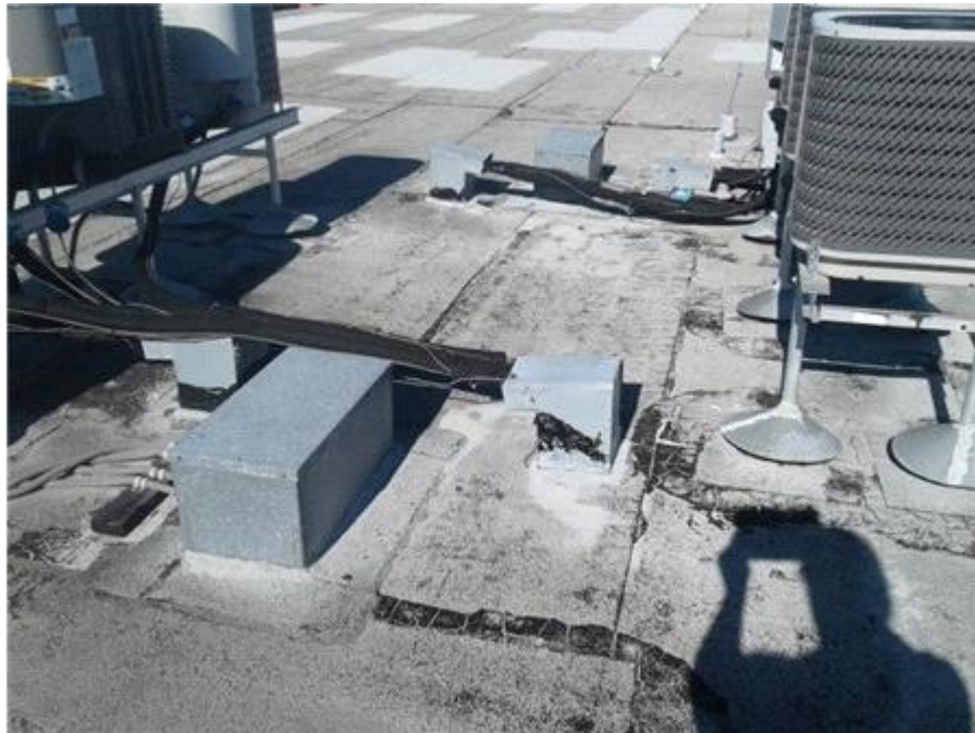
002F - The Towers - BUR Appearance Overview

The appearance of the roof is in fair condition at this time.