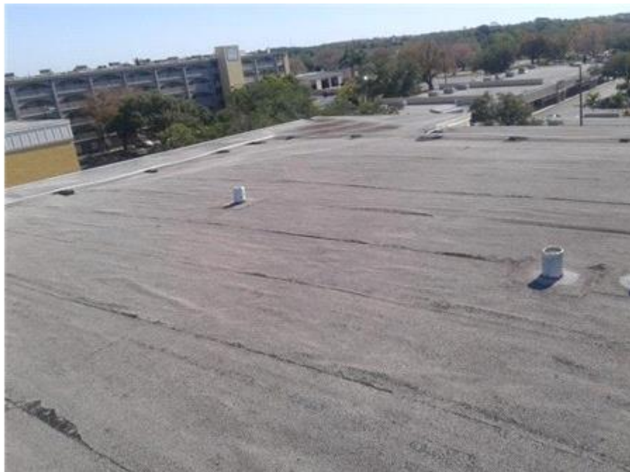
003F - The Towers - BUR Membrane Overview The roof membrane appears to be in fair condition at this time.