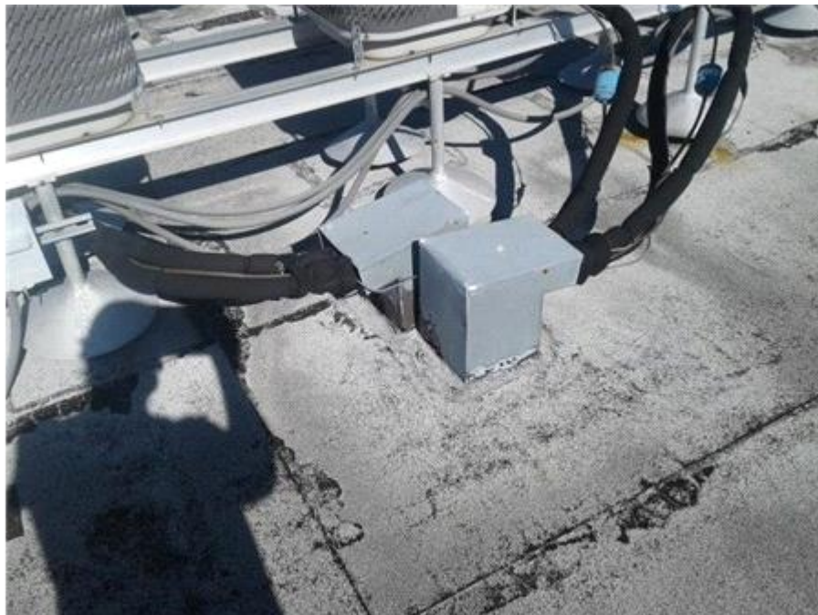
010F- The Towers - BUR Equipment Housing

Roof drains appear to be in good condition.