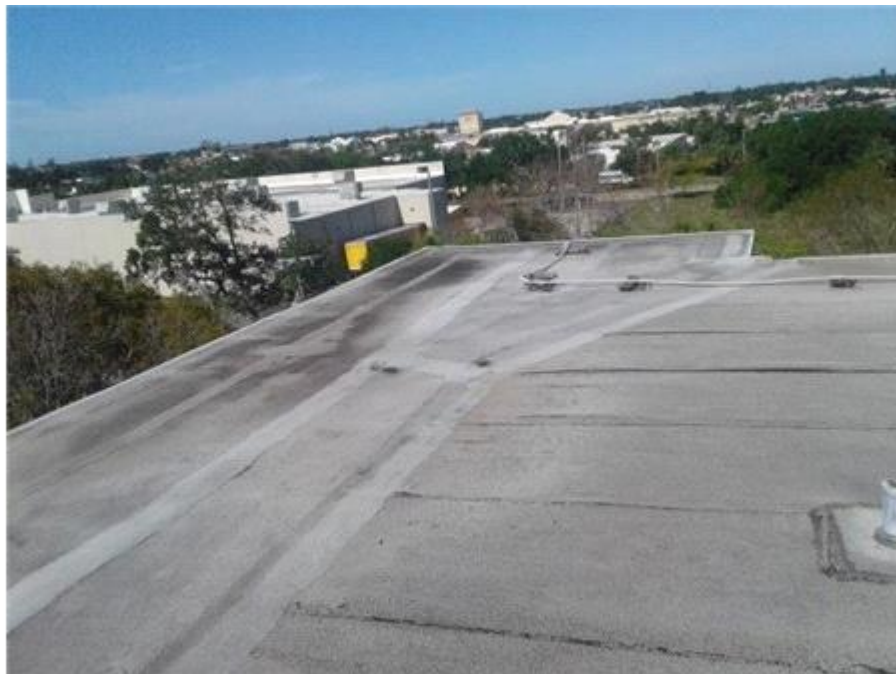
002F - The Towers - BUR Appearance Overview

The base flashings appear to be in fair condition.