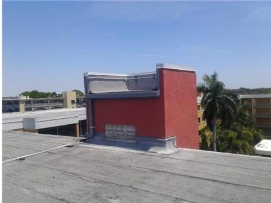
The Towers - BUR Elevator Shaft Roof Building Identification.