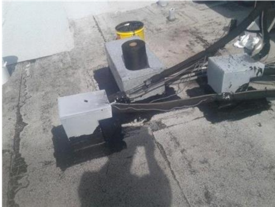
The Towers - BUR Sealant Deterioration/Failure