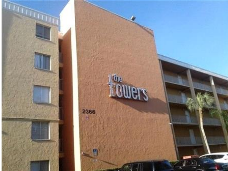
The Towers - BUR - Front of Building Building Identification