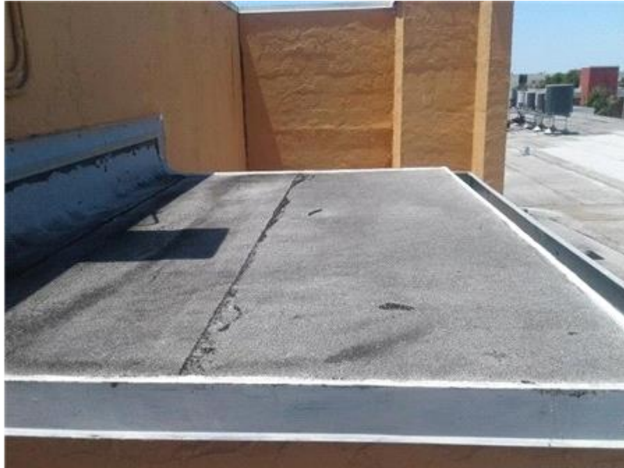
003F - The Towers - BUR Membrane Overview

The roof membrane appears to be in fair condition at this time.