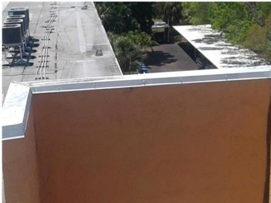
006F- The Towers - BUR Coping

The coping appears to be in fair condition.