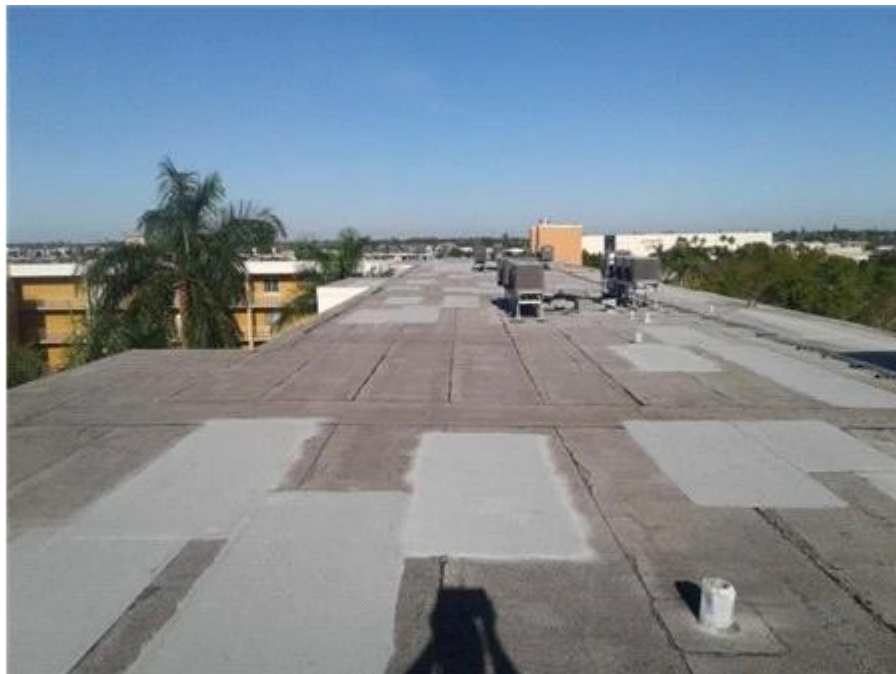
029- The Towers - BUR Roof Overview General roof overview.