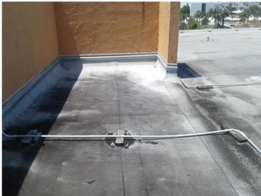
002F - The Towers - BUR Appearance Overview The appearance of the roof is in fair condition at this time.