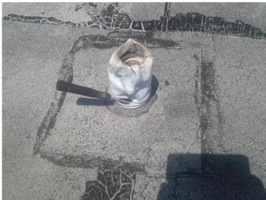
The Towers - BUR Lead Boot