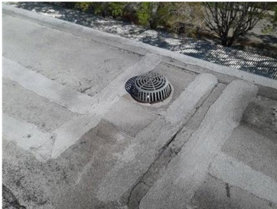
020F- The Towers - BUR Roof Drains

The equipment housing appears to be in fair condition.