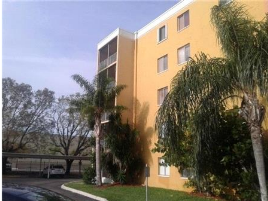
009G- The Towers - BUR Downspouts

The downspouts appear to be in good condition.