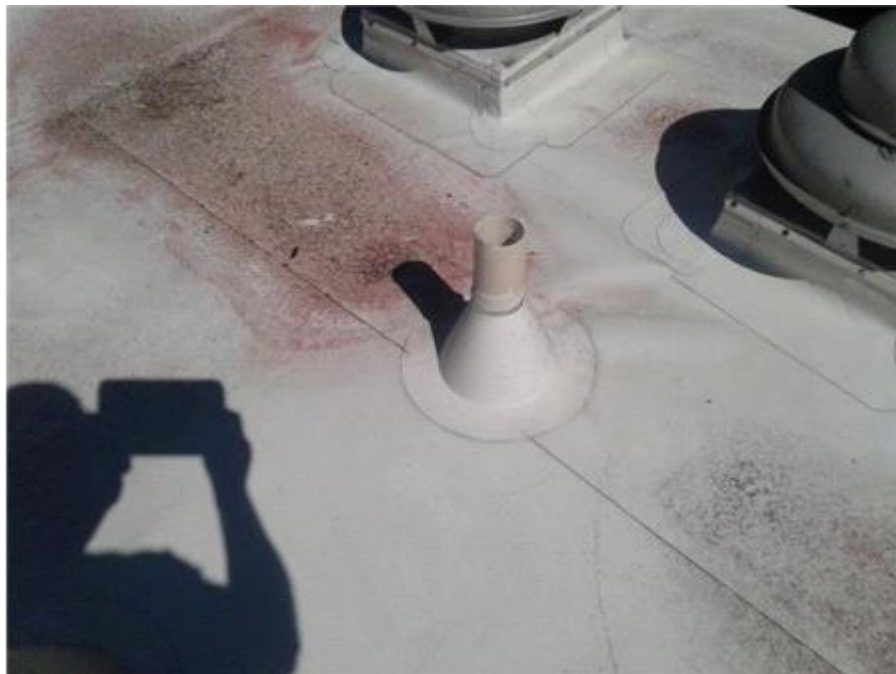
The Towers - TPO Roof Soil Stacks

Soil stack boots appear to be in good condition at this time.