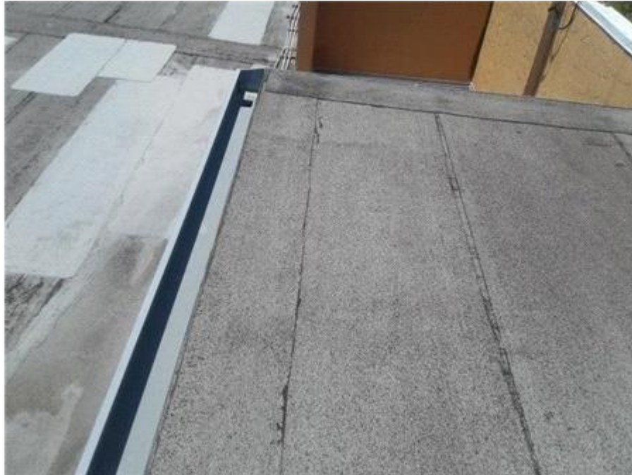
008G- The Towers - BUR Gutters

The gutters appear to be in good condition.