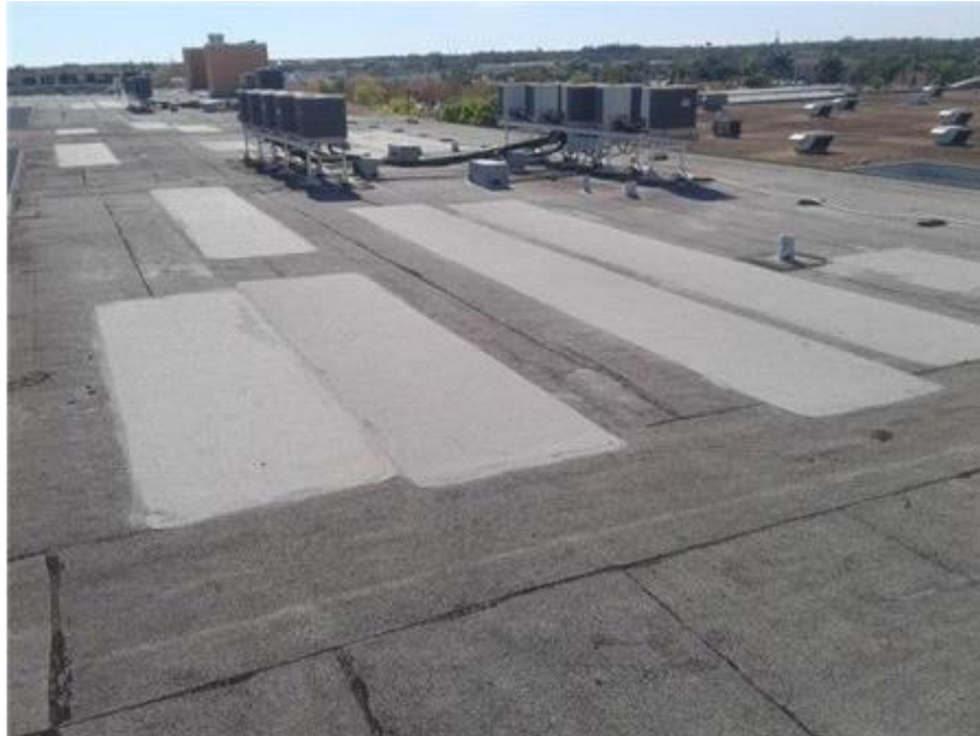
The Towers - BUR Field Membrane Blister repairs.