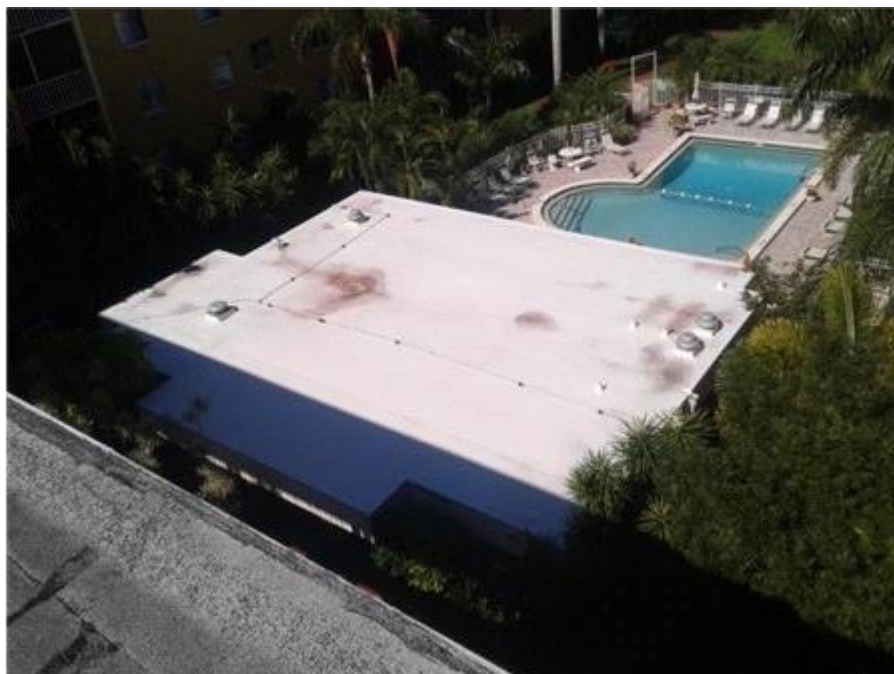
029- The Towers - TPO Roof - Roof Overview