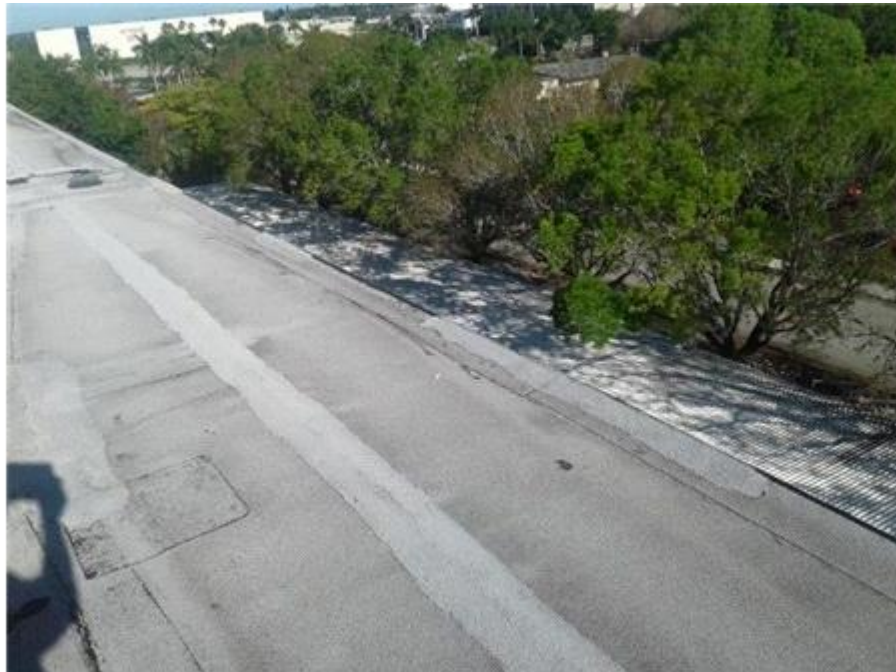
016F- The Towers - BUR Roof Edge

Lead boots appear to be in fair condition.