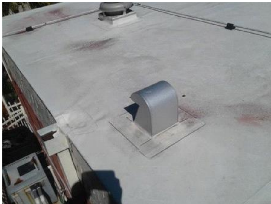
002G The Towers - TPO Roof Roof Vents

Scuppers appear to be in good condition at this time.