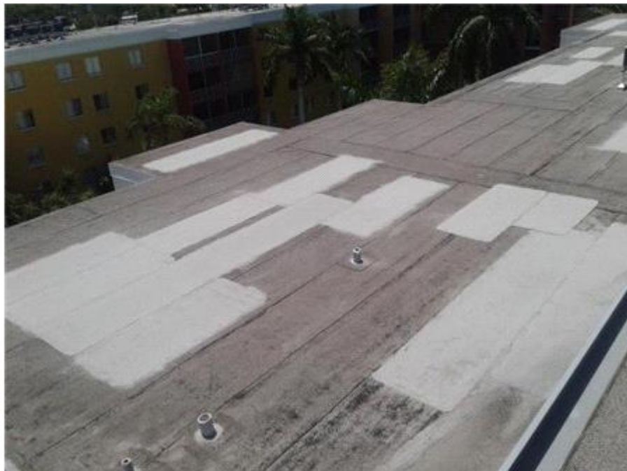
029- The Towers - BUR Roof Overview