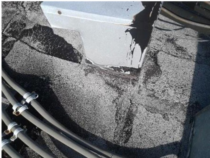
028- The Towers - BUR Sealant Deterioration/Failure

Removed lead boot and sealed base with M-1 sealant. Crowther Roofing suggests installing a new four (4) inch lead boot. (This repair will be completed as part of the monthly maintenance).