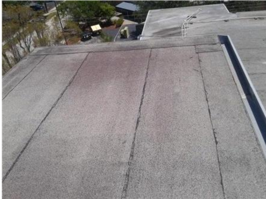
003F - The Towers - BUR Membrane Overview - Stairwell Roof

The roof membrane on the stairwell roof appears to be in fair condition at this time.