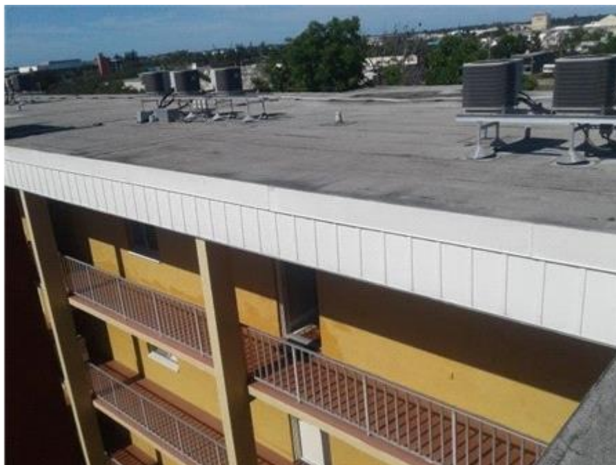
The Towers - BUR Edge Metal/Fascia

Edge metal/fascia appears to be in good condition at this time.