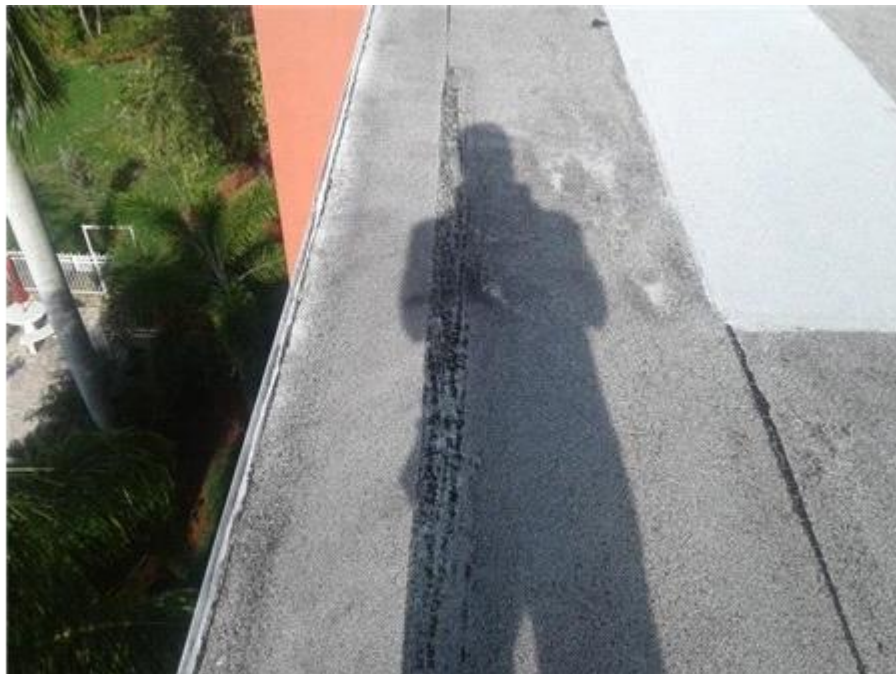
028- The Towers - BUR Sealant Deterioration/Failure

Removed existing sealant and replaced with M-1 sealant - approximately 100'.