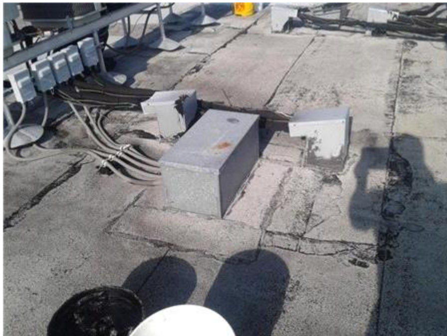
028- The Towers - BUR Sealant Deterioration/Failure Sealant should be removed and replaced to prevent water entry.