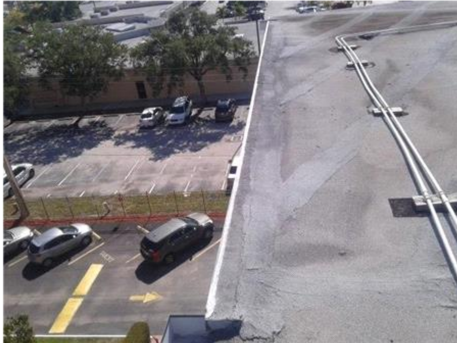
016F- The Towers - BUR Roof Edge

Roof edge appears to be in fair condition.