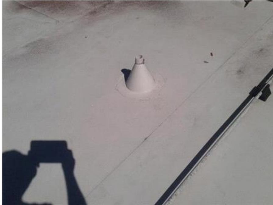
The Towers - TPO Roof Soil Stacks

Soil stack boots appear to be in good condition at this time.