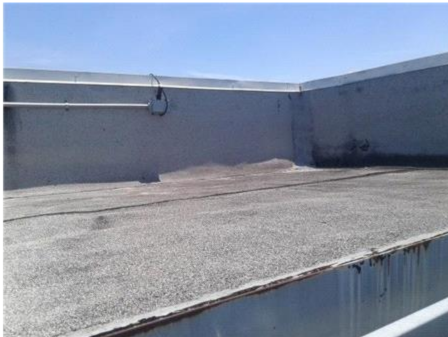
003F - The Towers - BUR Membrane Overview The roof membrane appears to be in fair condition at this time.