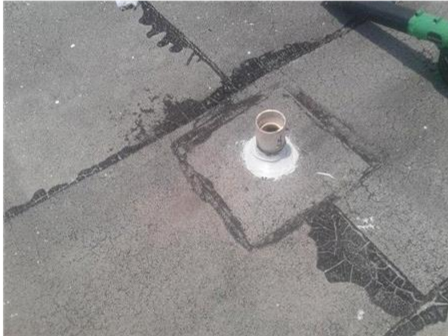
The Towers - BUR Lead Boot

Removed lead boot and sealed base with M-1 sealant. Crowther Roofing suggests installing a new four (4) inch lead boot. (This repair will be completed as part of the monthly maintenance).