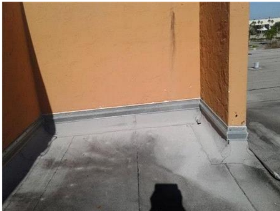
005F- The Towers - BUR Counter Flashing

The base flashings appear to be in fair condition.