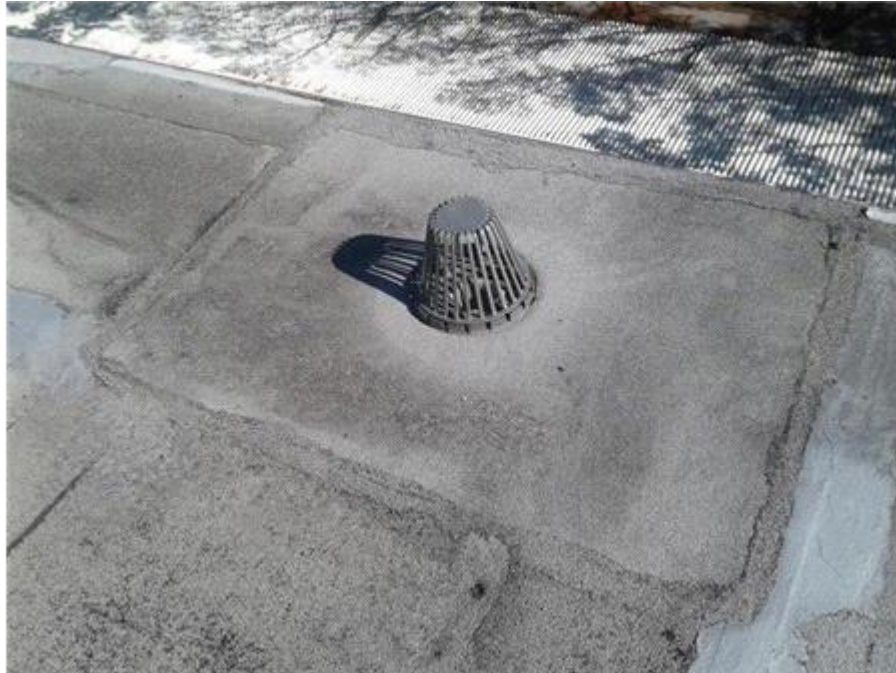
020G- The Towers - BUR Roof Drains

Roof drains appear to be in good condition.