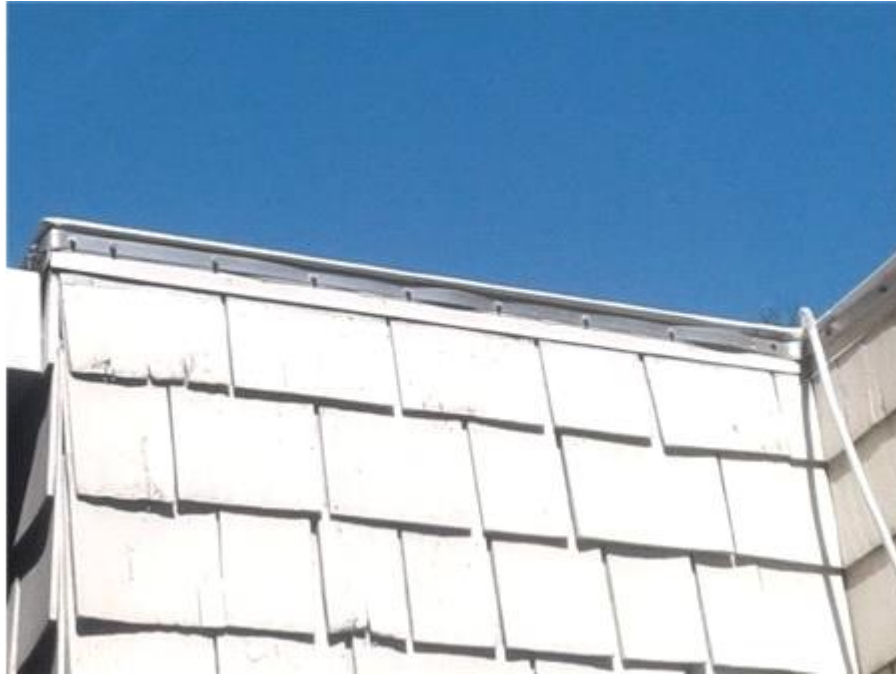
The Towers - TPO Roof Termination Bar

T-Bar appears to be in good condition at this time.