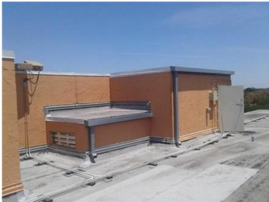
The Towers - BUR Elevator Shaft Roof

The appearance of the roof is in fair condition at this time.