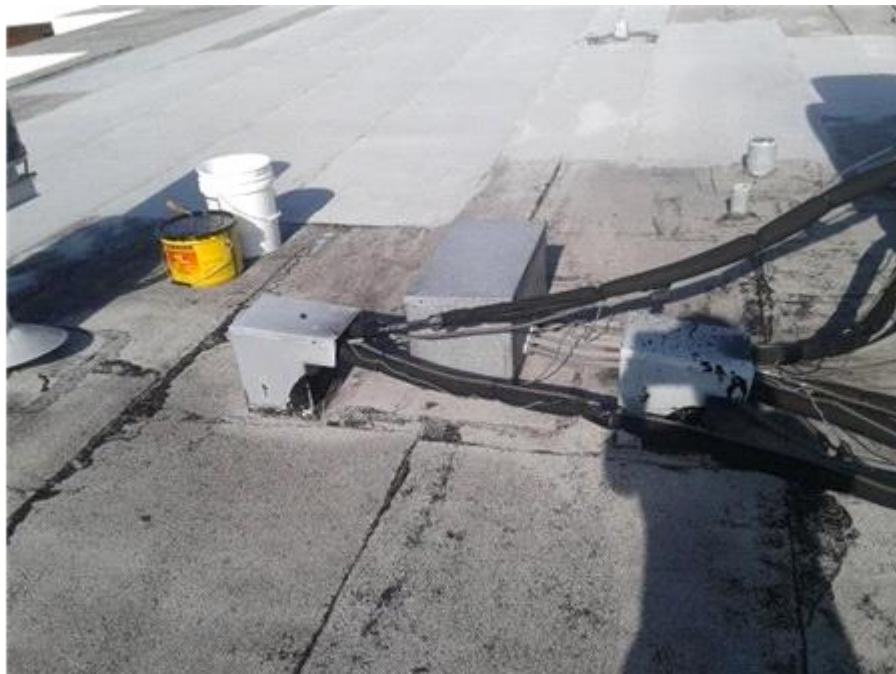
028- The Towers - BUR Sealant Deterioration/Failure Sealant should be removed and replaced to prevent water entry.