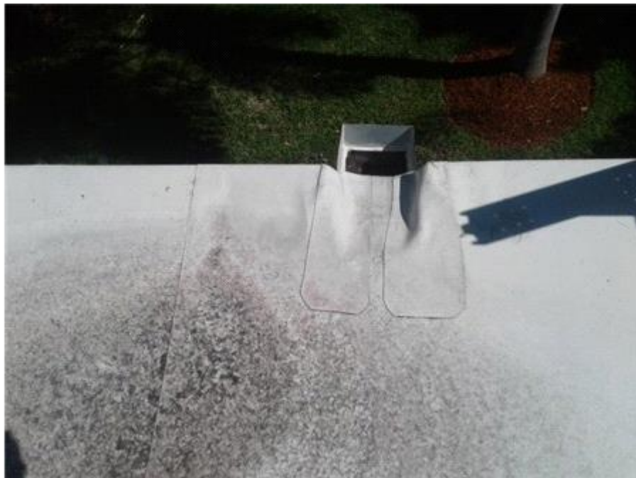
The Towers - TPO Roof Scuppers

The gutters appear to be in good condition.