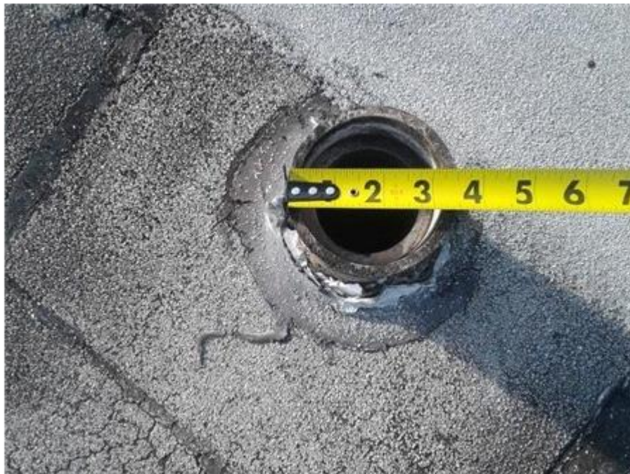
The Towers - BUR Lead Boot