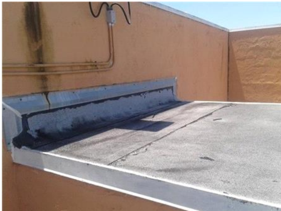
004F - The Towers - BUR Base Flashings

The roof membrane appears to be in fair condition at this time.