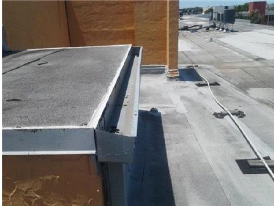
008G- The Towers - BUR Gutters The gutters appear to be in good condition.