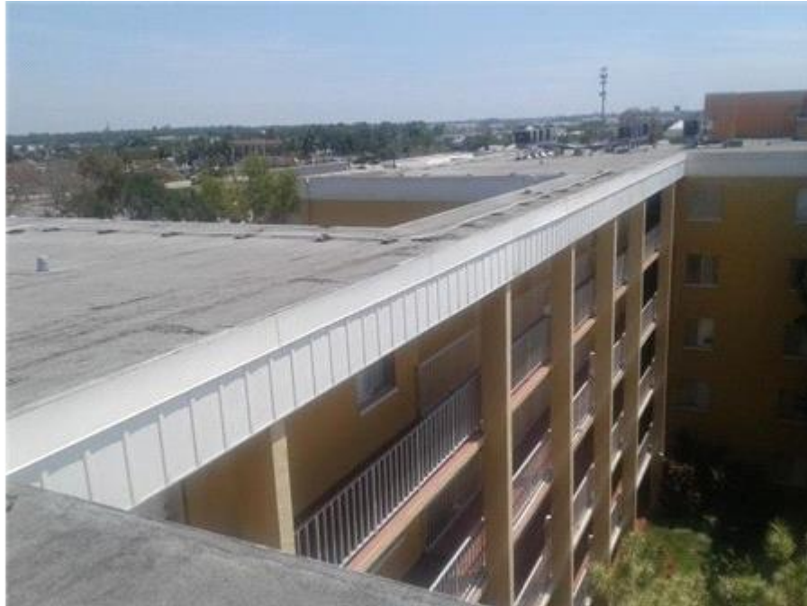
The Towers - BUR Edge Metal/Fascia

Edge metal/fascia appears to be in good condition at this time.