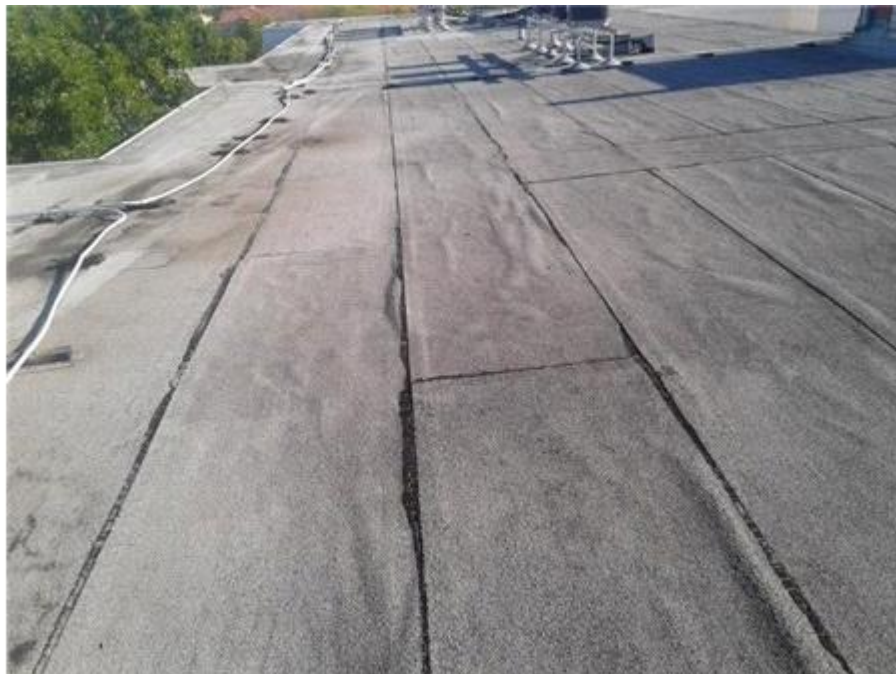
003F - The Towers - BUR Membrane Overview

The appearance of the roof is in fair condition at this time.