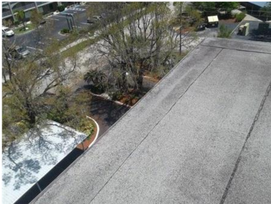
016F- The Towers - BUR Roof Edge

The roof membrane on the stairwell roof appears to be in fair condition at this time.