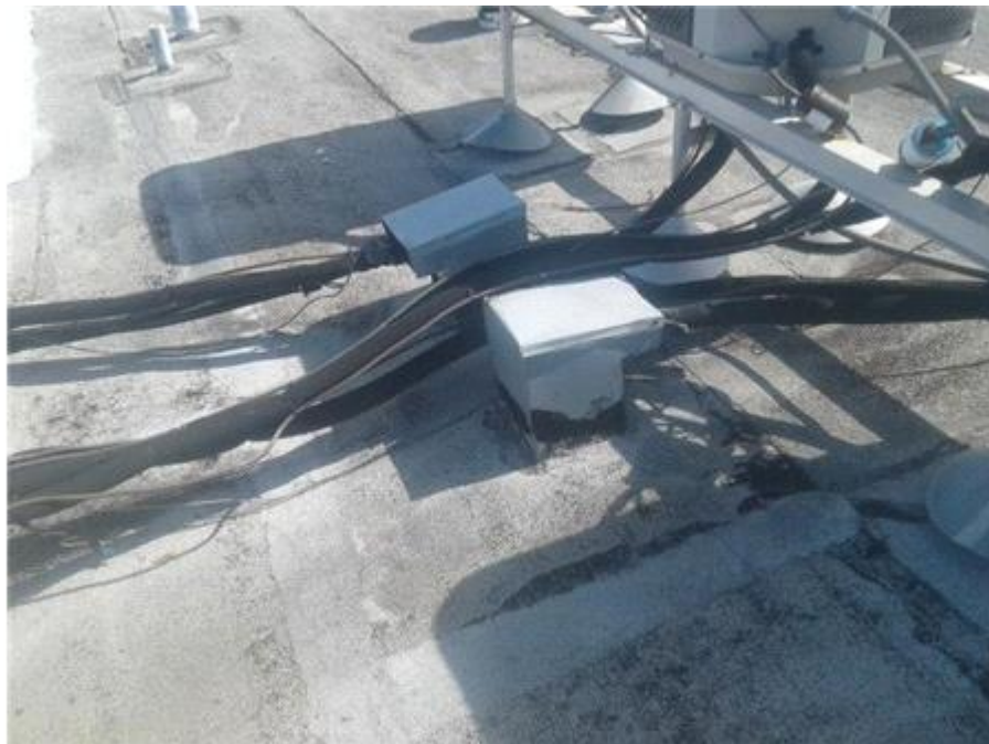
028- The Towers - BUR Sealant Deterioration/Failure

Sealant should be removed and replaced to prevent water entry.