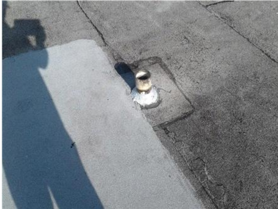
The Towers - BUR Lead Boot

Removed lead boot and sealed base with M-1 sealant. Crowther Roofing suggests installing a new four (4) inch lead boot. (This repair will be completed as part of the monthly maintenance).