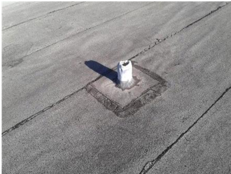
019F- The Towers - BUR Lead Boots

The roof surface appears to be in fair condition at this time.