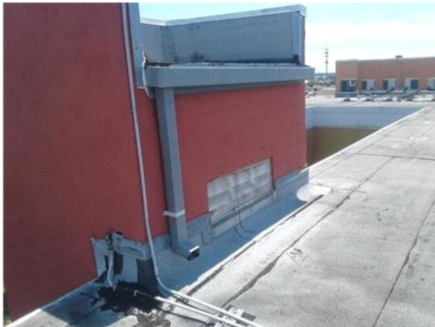
009G- The Towers - BUR Downspouts

The gutters appear to be in good condition.