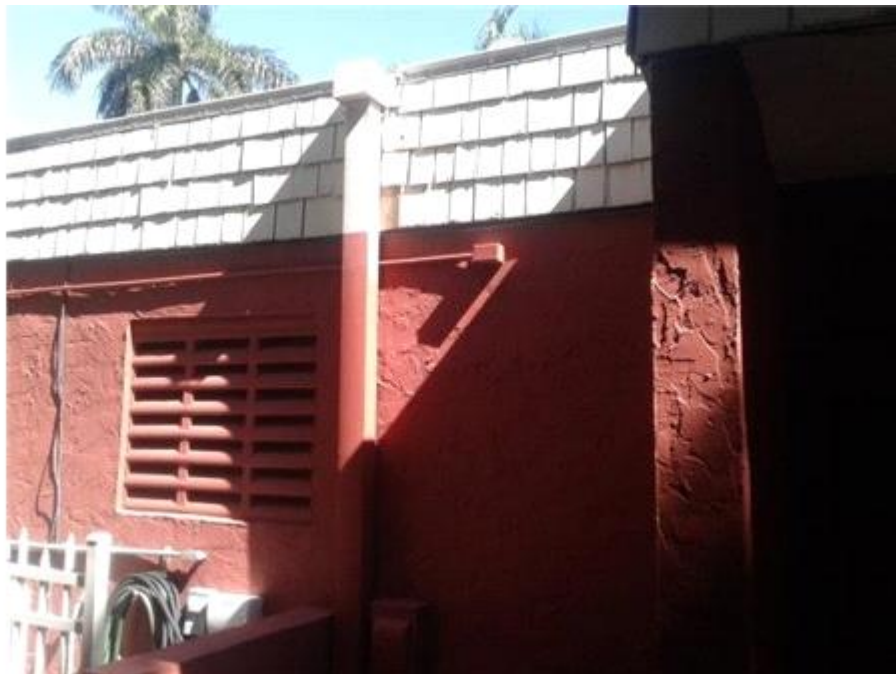
009G- The Towers - TPO Roof Downspouts The downspouts appear to be in good condition.