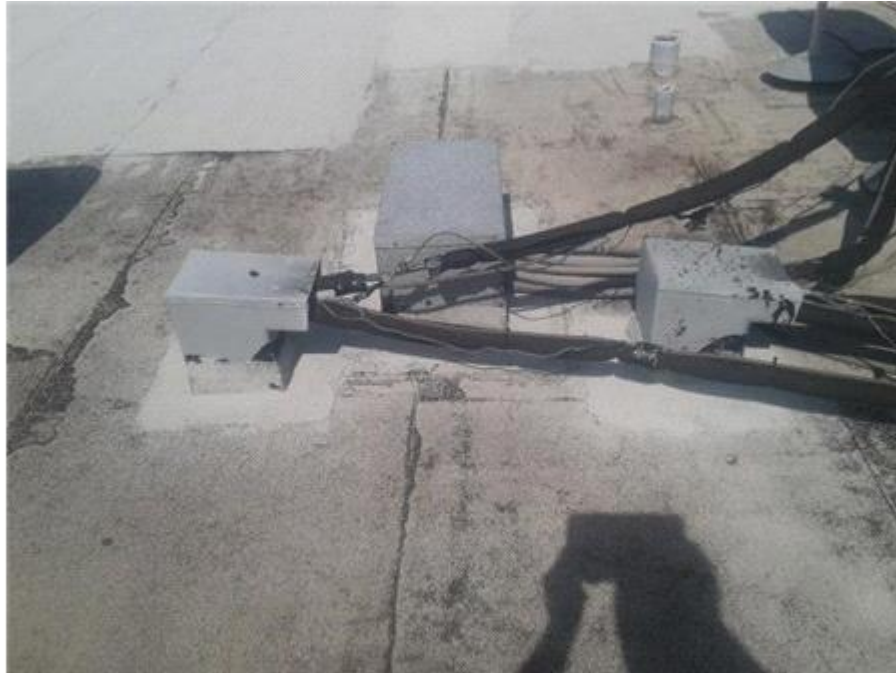
The Towers - BUR Sealant Deterioration/Failure Repairs made by three coursing and granulating.