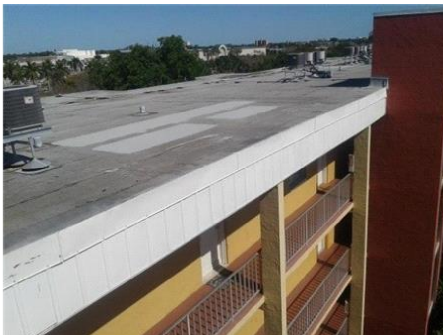
The Towers - BUR Edge Metal/Fascia

Edge metal/fascia appears to be in good condition at this time.