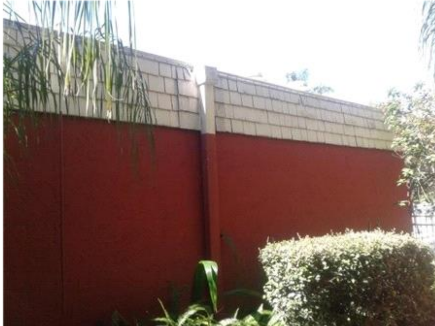
009G- The Towers - TPO Roof Downspouts The downspouts appear to be in good condition.