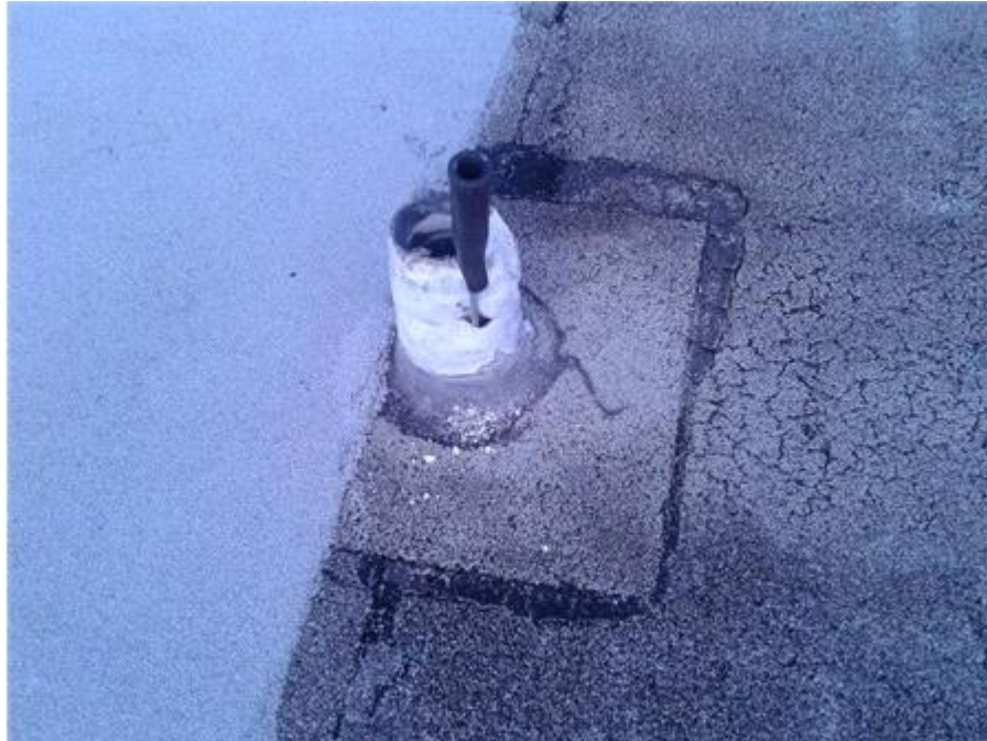
The Towers - BUR Lead Boot