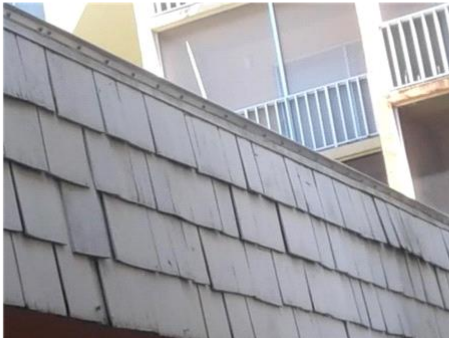
The Towers - TPO Roof Termination Bar

T-Bar appears to be in good condition at this time.