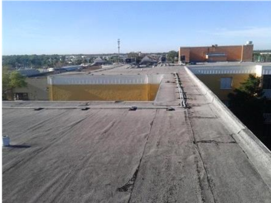
029- The Towers - BUR Roof Overview