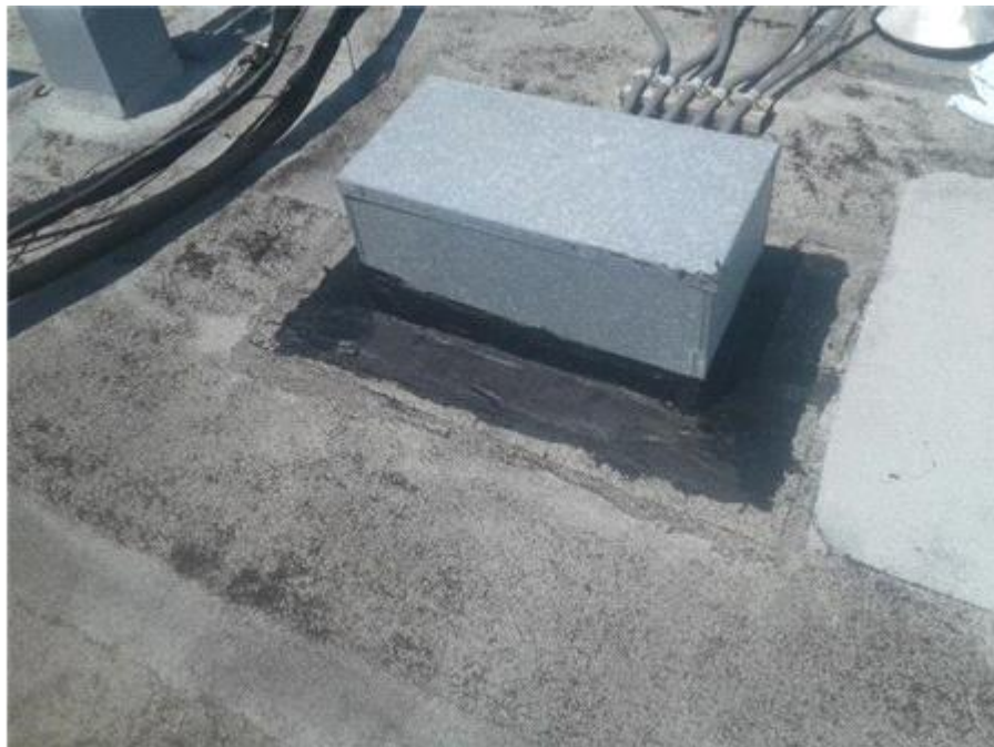
The Towers - BUR Sealant Deterioration/Failure