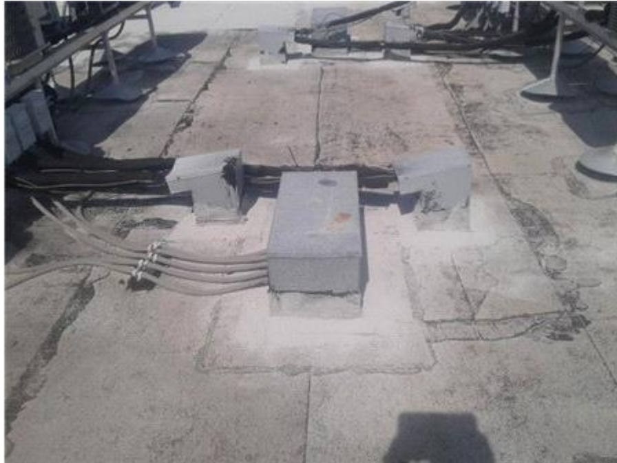
The Towers - BUR Sealant Deterioration/Failure Repairs made by three coursing and granulating.