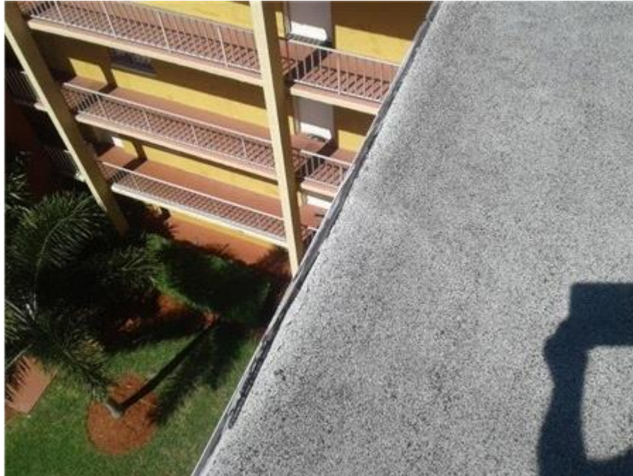
The Towers - BUR Sealant Deterioration/Failure