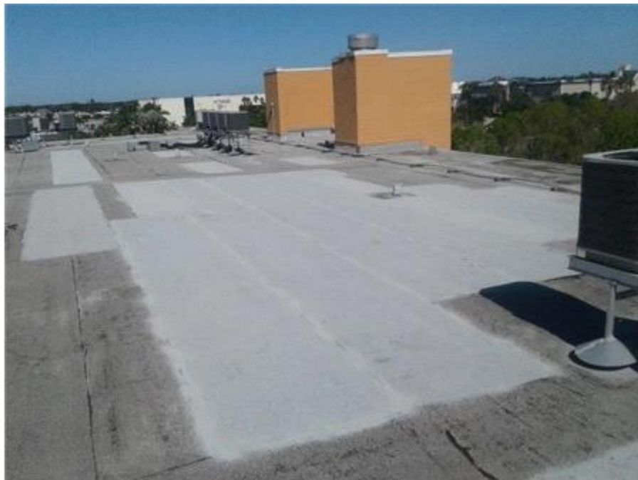
The Towers - BUR Field Membrane

The appearance of the roof is in fair condition at this time.