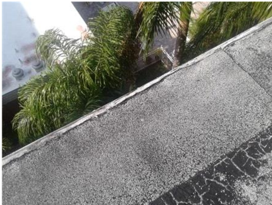
028- The Towers - BUR Sealant Deterioration/Failure

The downspouts appear to be in good condition.