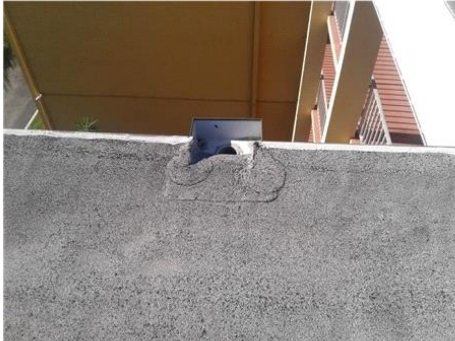
The Towers - BUR Scuppers

Scuppers appear to be in fair condition at this time.