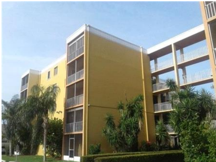
009G- The Towers - BUR Downspouts

Edge metal/fascia appears to be in good condition at this time.