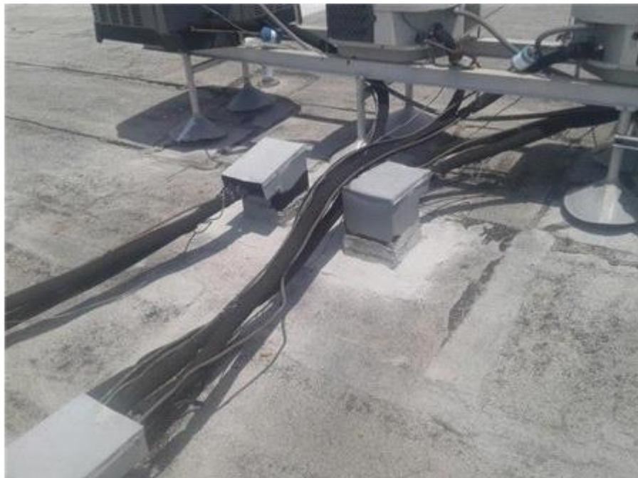
The Towers - BUR Sealant Deterioration /Failure Repairs made by three coursing and granulating.