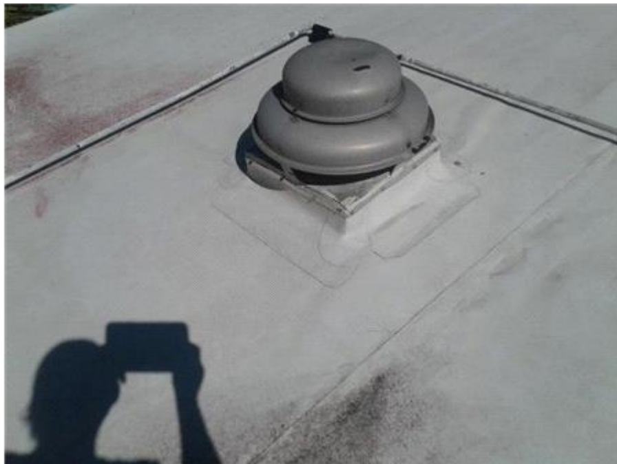
004G - The Towers - TPO Roof Base Flashings

The base flashings appear to be in good condition.