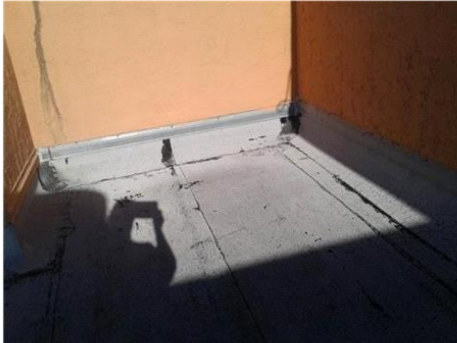
004F - The Towers - BUR Base Flashings

The base flashings appear to be in fair condition.