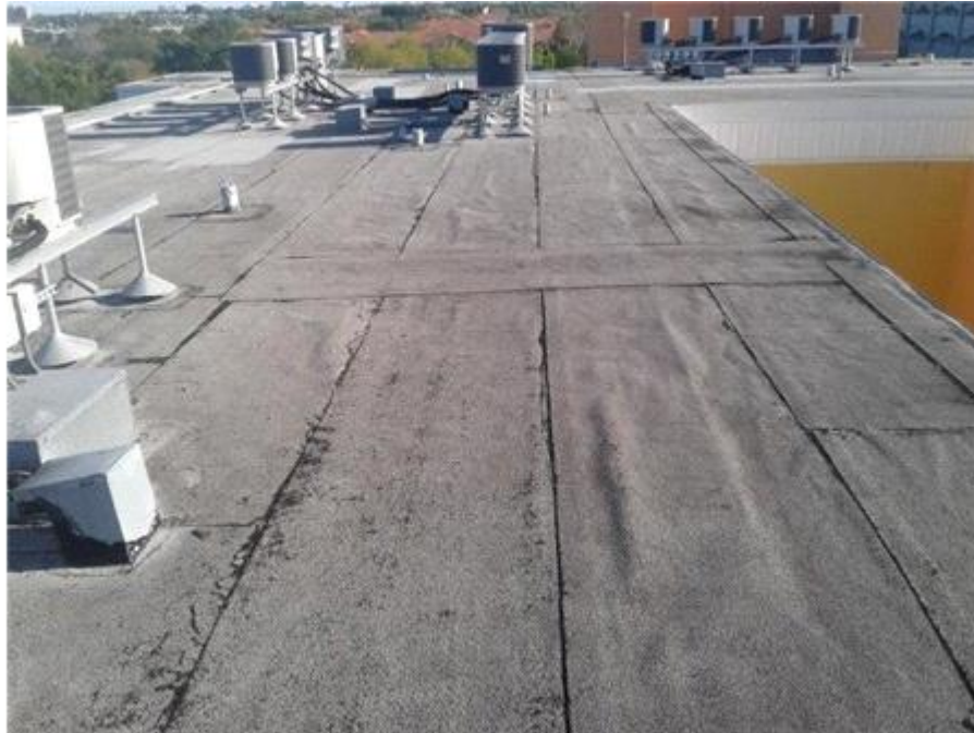
001F - The Towers - BUR Surface Overview

The roof surface appears to be in fair condition at this time.