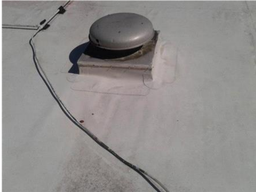
004G - The Towers - TPO Roof Base Flashings

The base flashings appear to be in good condition.