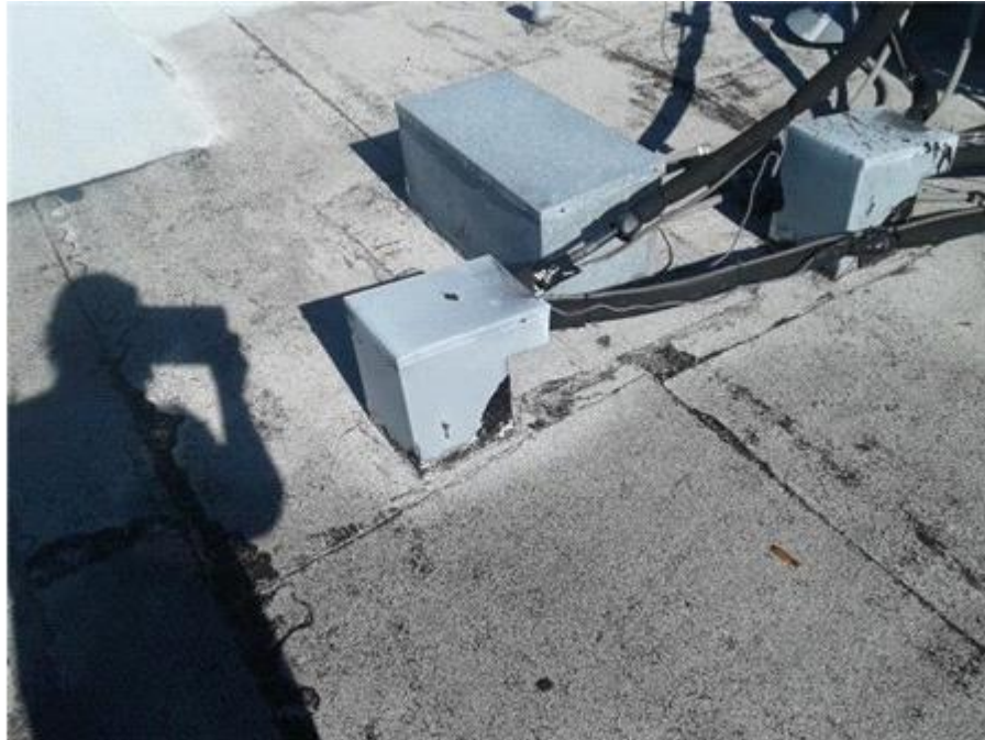
010F- The Towers - BUR Equipment Housing

The equipment housing appears to be in fair condition.