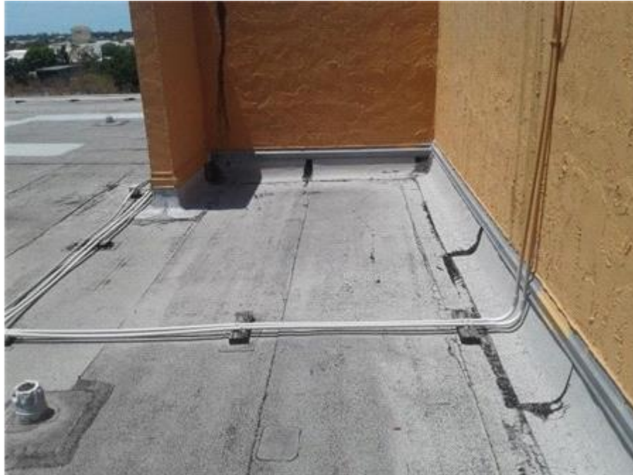
002F - The Towers - BUR Appearance Overview

The appearance of the roof is in fair condition at this time.