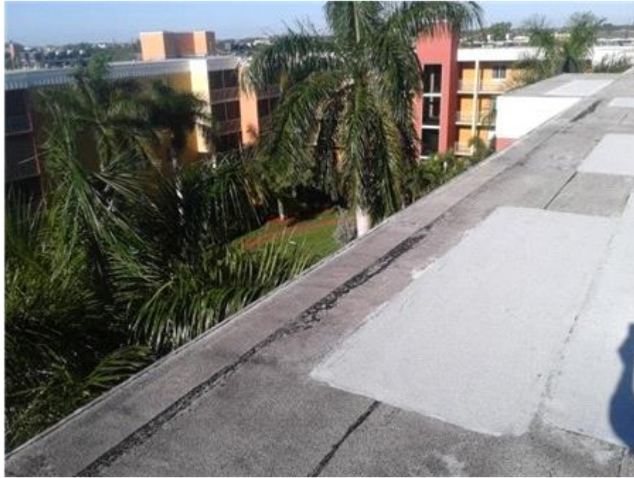
016F- The Towers - BUR Roof Edge

Roof edge appears to be in fair condition.