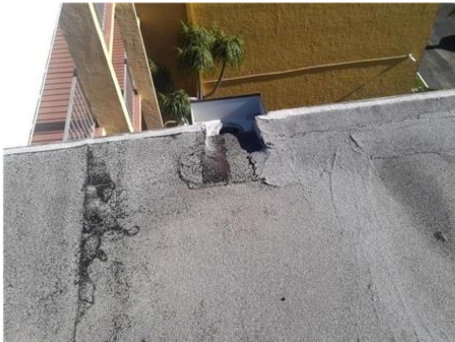
The Towers - BUR Scuppers

Scuppers appear to be in fair condition at this time.