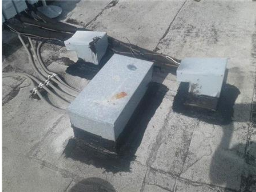
The Towers - BUR Sealant Deterioration/Failure