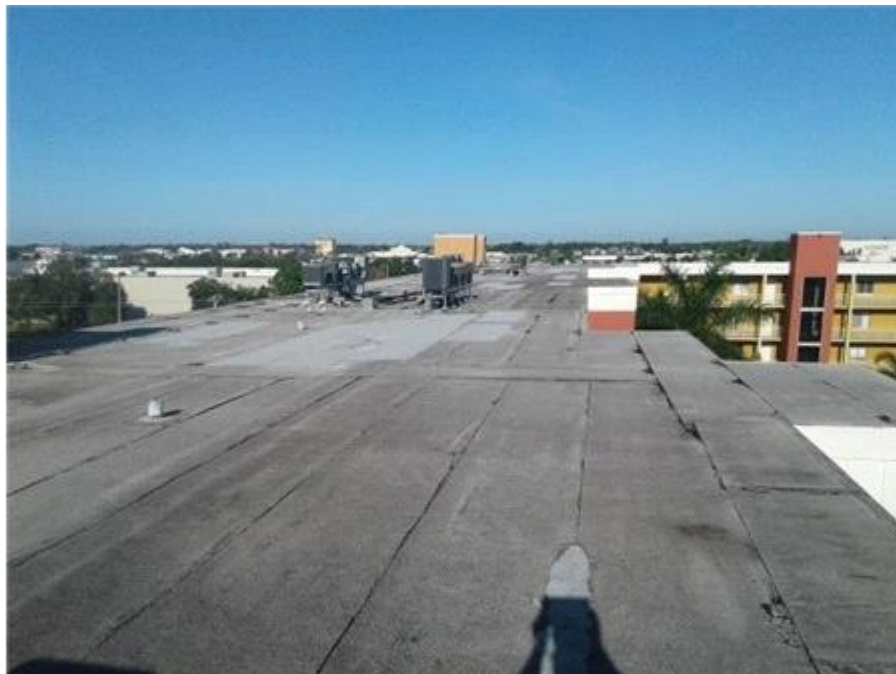
029- The Towers - BUR Roof Overview