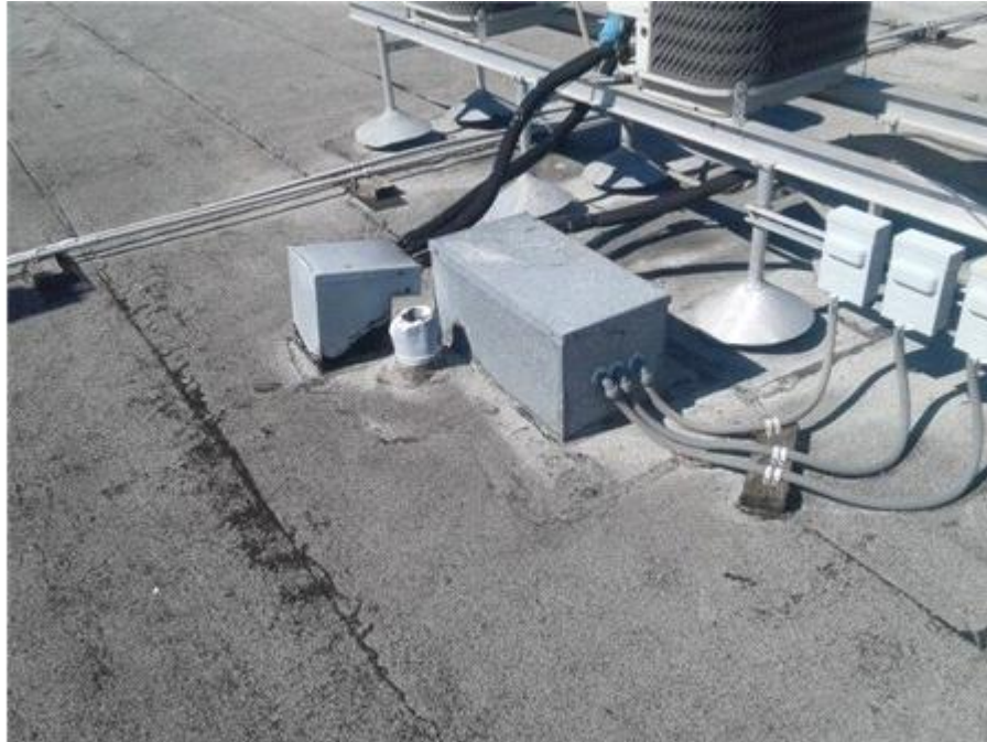
002F - The Towers - BUR Appearance Overview

The appearance of the roof is in fair condition at this time.