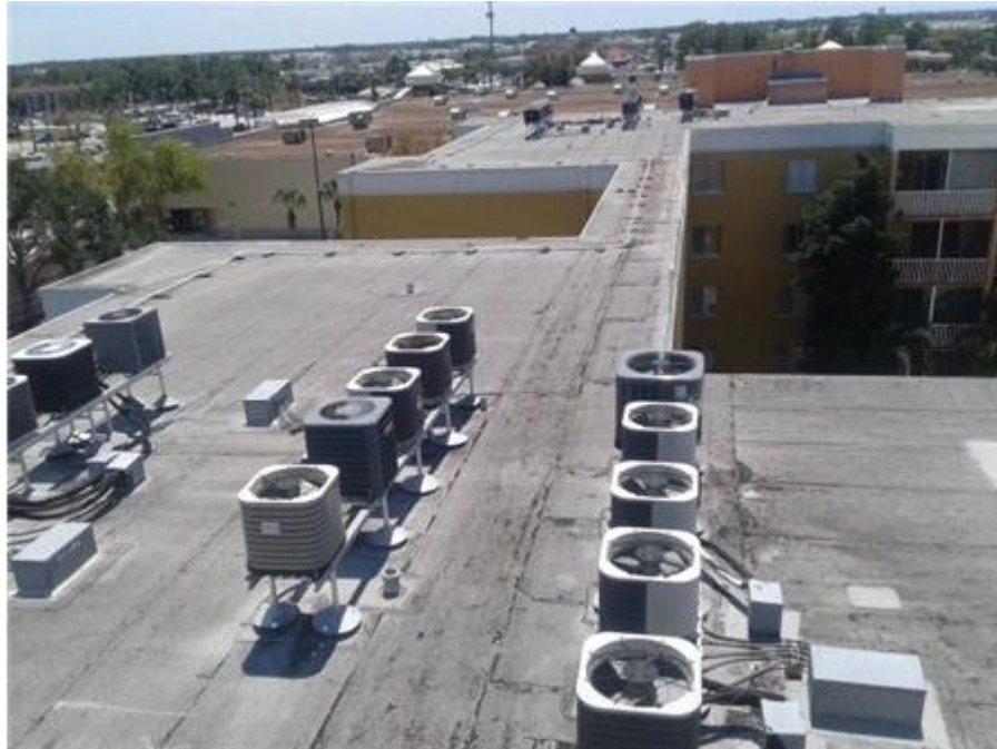
029- The Towers - BUR Roof Overview