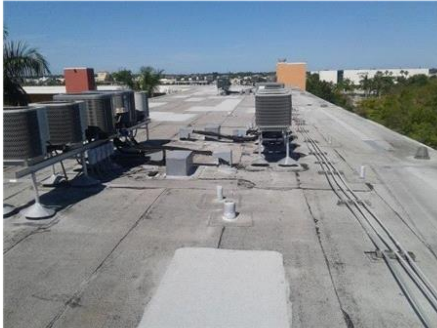
002F - The Towers - BUR Appearance Overview

The appearance of the roof is in fair condition at this time.