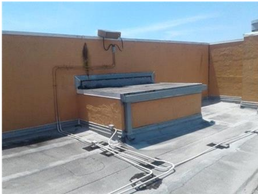
The Towers - BUR Elevator Shaft Roof

Removed existing sealant and replaced with M-1 sealant.