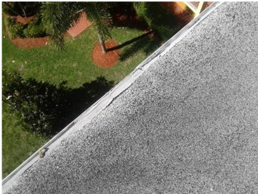
028- The Towers - BUR Sealant Deterioration/Failure

The appearance of the roof is in fair condition at this time.