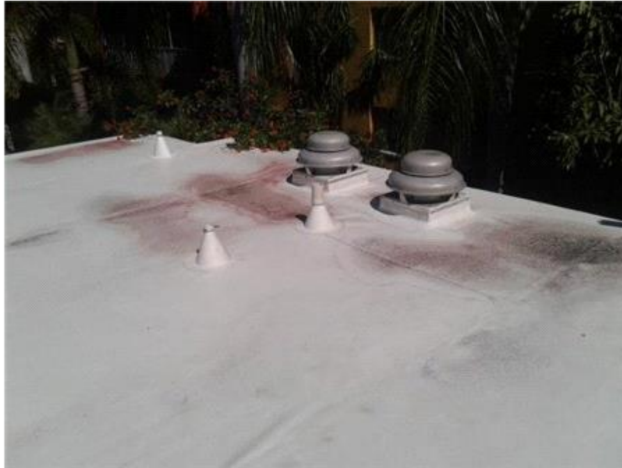
002G- The Towers - TPO Roof Appearance Overview

The roof appearance is in good, maintainable condition at this time.