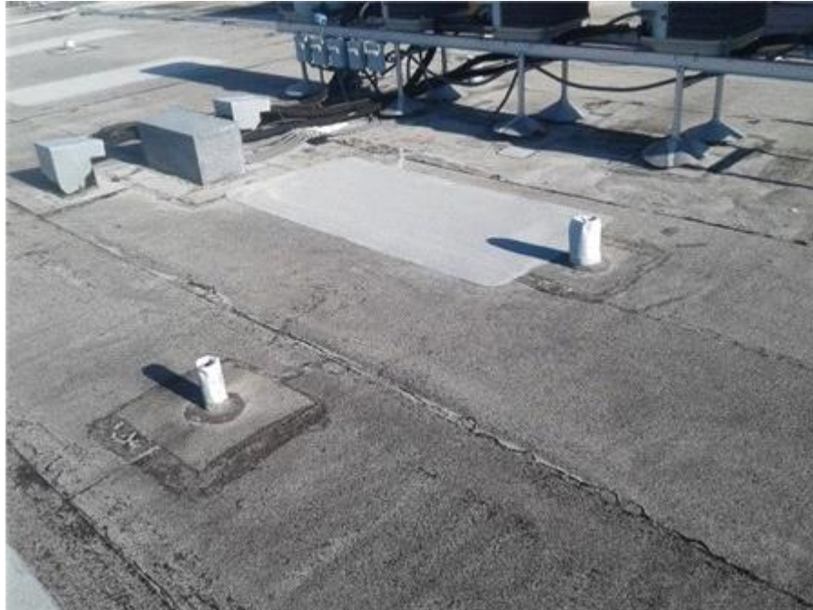
019F- The Towers - BUR Lead Boots

Lead boots appear to be in fair condition.