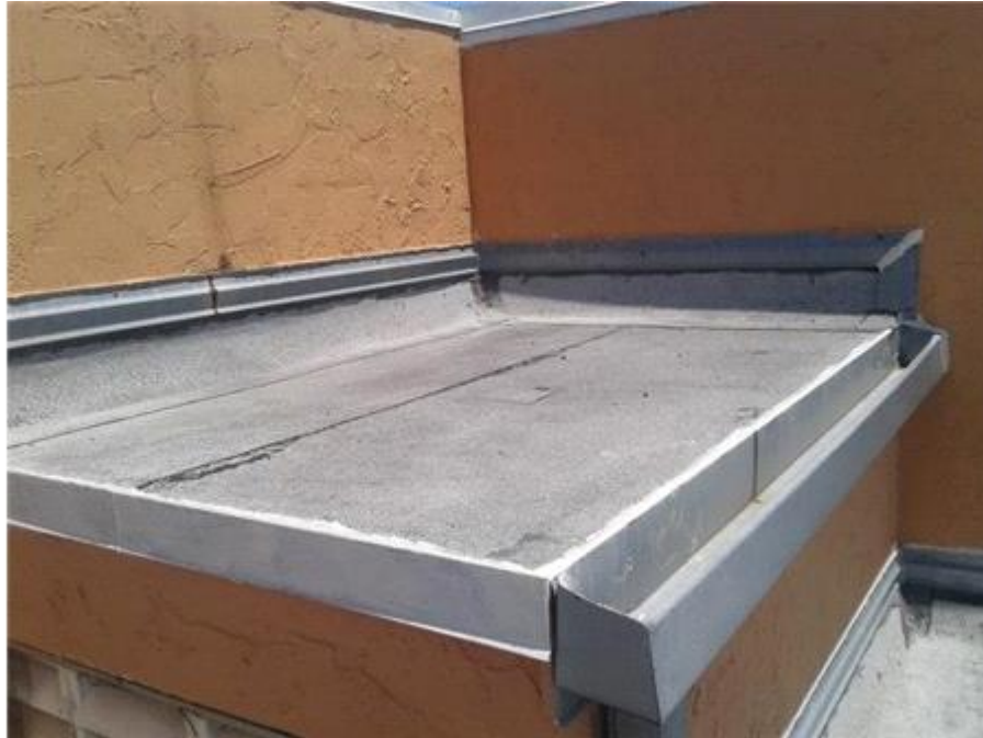
003F - The Towers - BUR Membrane Overview

The roof membrane appears to be in fair condition at this time.