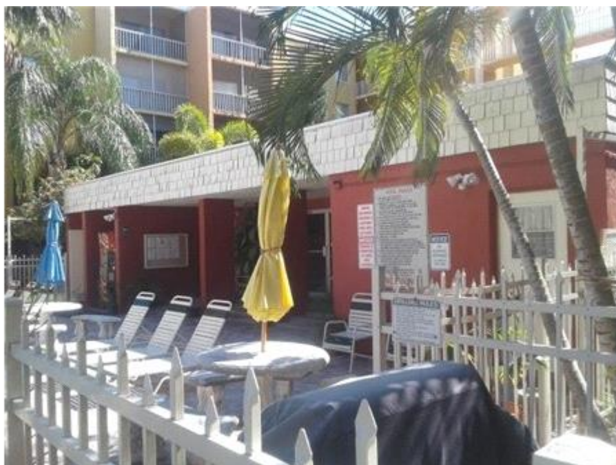
The Towers - TPO Roof - Front of Building