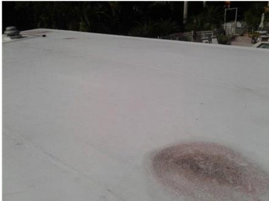
001G- The Towers - TPO Roof Surface Overview

The membrane appears to be in good, maintainable condition at this time.