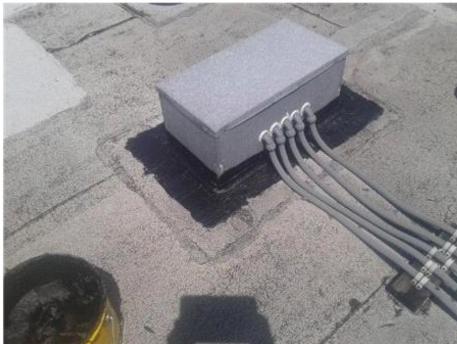
The Towers - BUR Sealant Deterioration /Failure