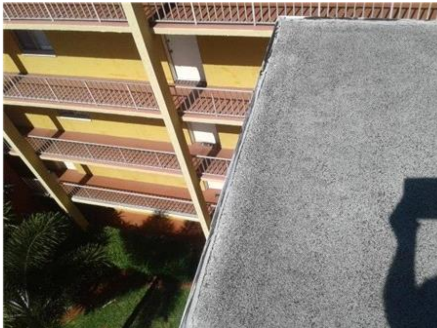
028- The Towers - BUR Sealant Deterioration/Failure

Sealant should be removed and replaced to prevent water entry.